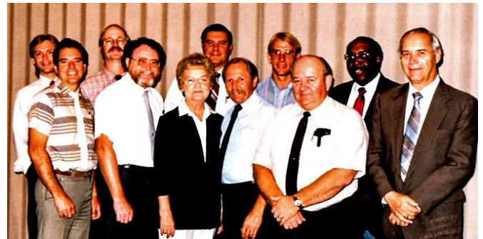
CA State office Engineering Staff, 1990s.