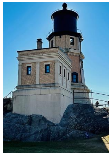
Split Rock Lighthouse in Two Harbors, Minnesota