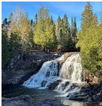
Gooseberry Falls in Two Harbors, Minnesota

SENIOR CONSERVATIONISTS: Senior Conservationists have reached the minimum age of 83 years and have completed the Senior Conservationist Questionnaire (download at https://arcsecommunications.wordpress.com/senior-conservationists/ ). See IN-MEMORIAM for the Senior Conservationists who have left us since the last Newsletter. Please help us identify retirees who should be named Senior Conservationists. Please provide their contact information to your ARCSE Representative or Regional Vice-President.