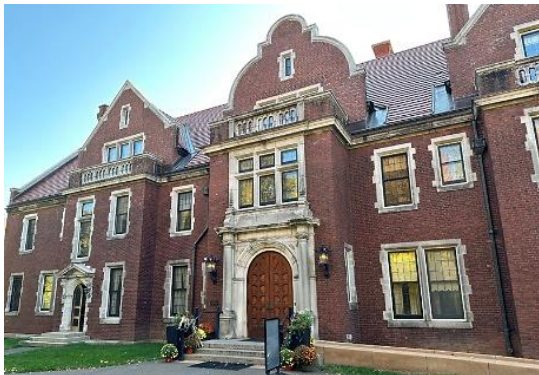
Glensheen Mansion in Duluth, Minnesota. NOTE: Free App to download to take a virtual tour of the mansion.