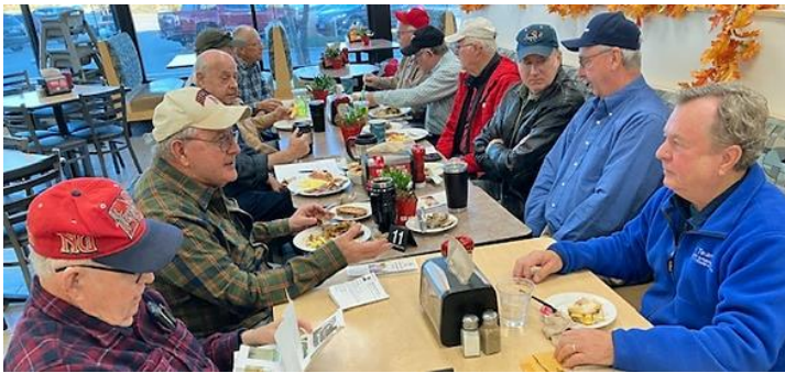
There was excellent attendance for this group of SCS/NRCS retirees at the Stacy Lane Hy-Vee, 70 th and Pioneers in Lincoln.