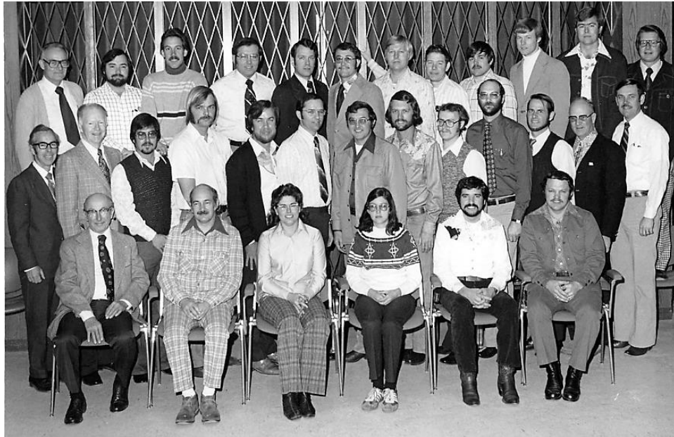
SOIL MECHANICS SHORTCOURSE, Level II, January 5 – February 11, 1977