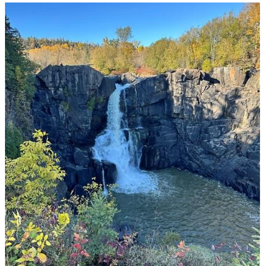
Grand Portage Falls in Grand Portage, Minnesota on the border of Ontario, Canada