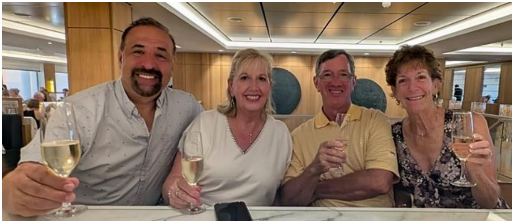
Celebrating our 39 th Wedding Anniversary on the Viking Cruise Ship