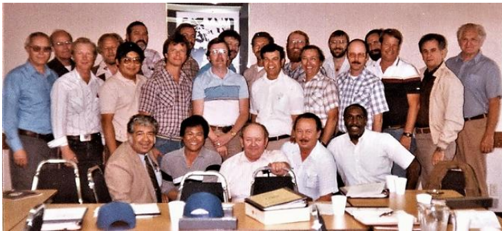
CA Engineering staff, Area Engineers, Admin Staff, Project Engineers, early 1980s.