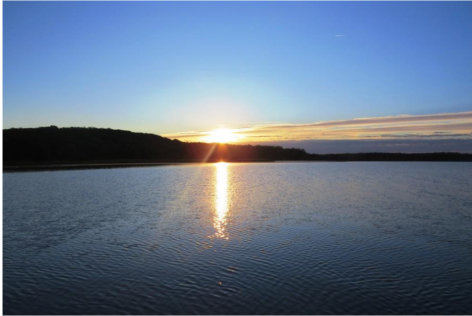
Sunrise on the water.