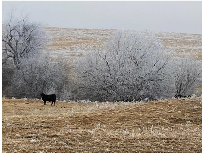
Heavy fog turns to ice crystals one morning in December