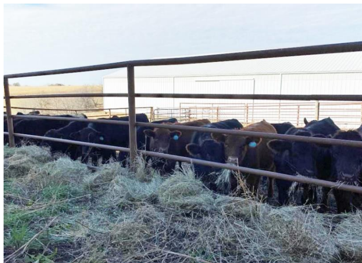
Weaning spring calves in November