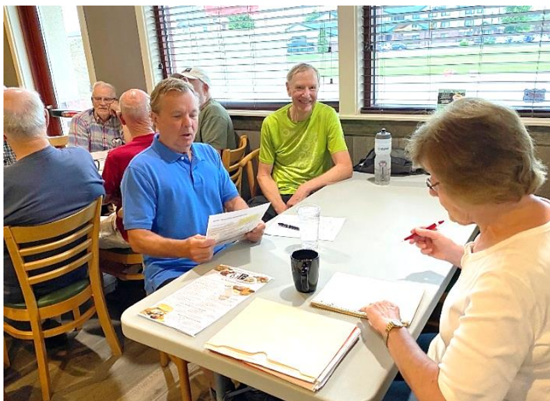
Our Lincoln Retirees Club experienced some challenging times this year. We started of the year with zoom meeting because of COVID and ended the year with a canceled meeting due to extreme cold blizzard winter weather. However in between we had some excellent meetings such as the above one held in June, 2022.