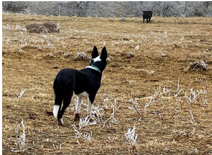
Border Collie Grace focused on a steer.