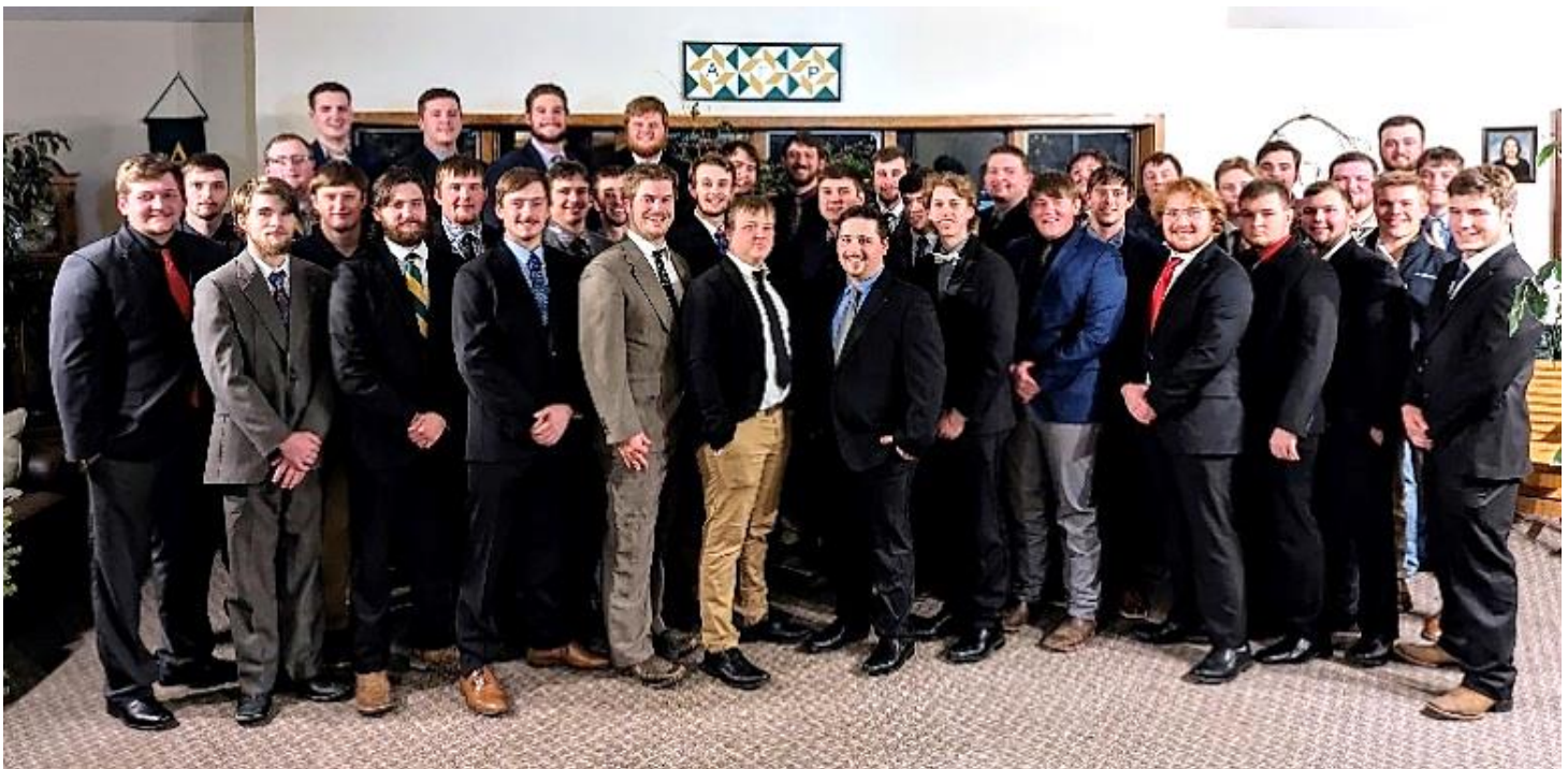
Alpha Gamma Rho-Alfa Psi Chapter, River Falls, WI