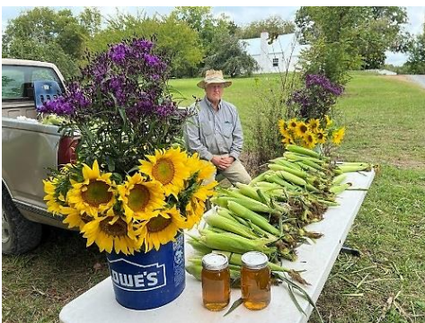
Van with produce