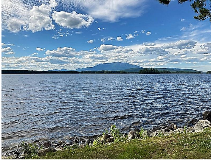
Millinocket Lake in Foreground and Mount Katahdin in far background–Beautiful and relaxing!

We had a lively crowd of 9 on Oct. 11 th at Dysarts. The weather was great, but lots of fog at my home for a bit. Everyone was in good spirits and still able to handle getting older gracefully.