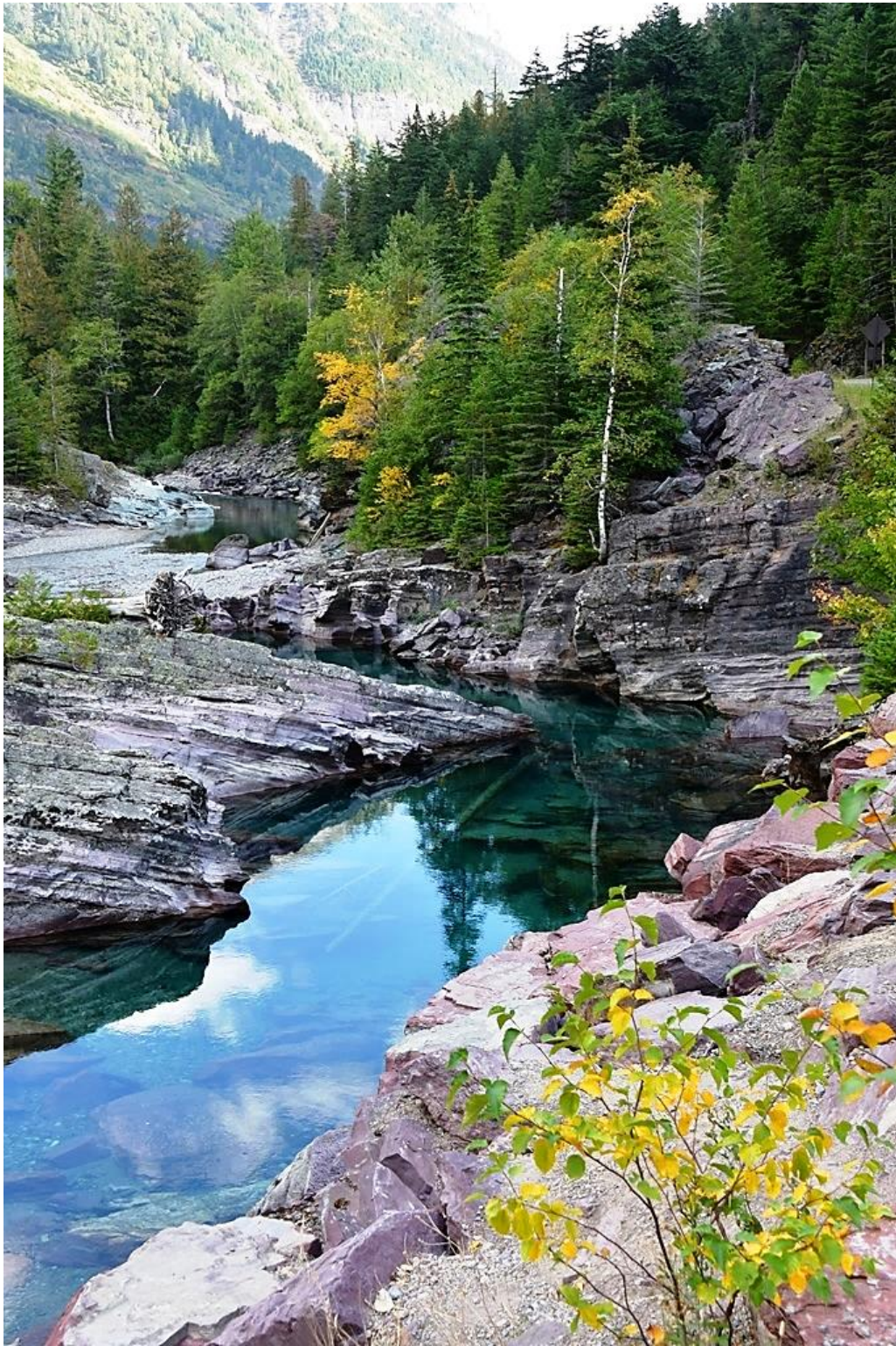
In Glacier National Park