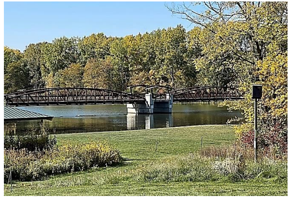
Bridge on a trail in Fort Des Moines Park