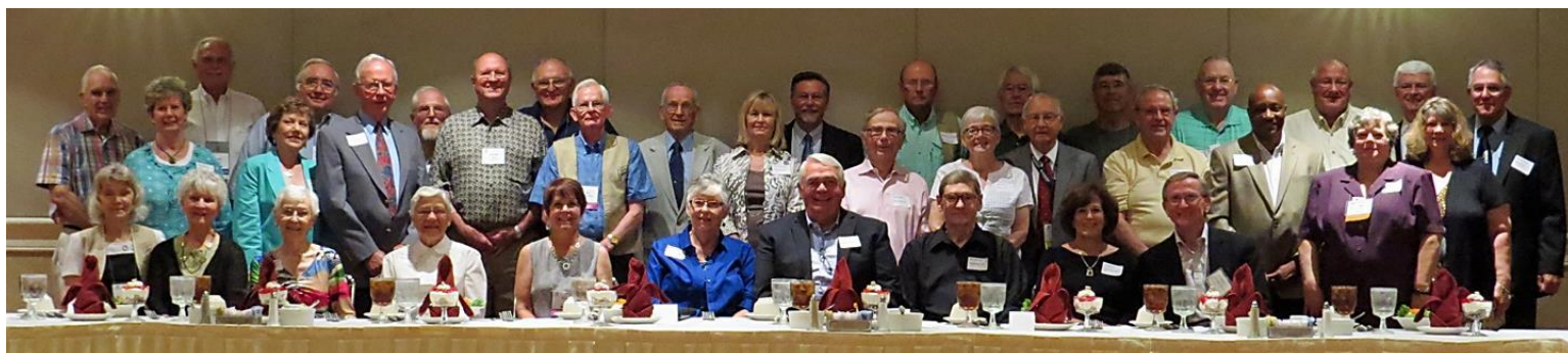
Participants, Annual ARCSE Luncheon, Greensboro, NC