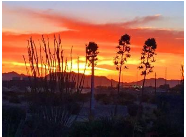
Some Beautiful Sunsets!

I have been keeping very busy playing music as a member of the Western Lights trio with quite a diversity of playing venues. Most recently we provided music for a wedding and before that we played for a bunch of fly fishermen at our local fly shop.