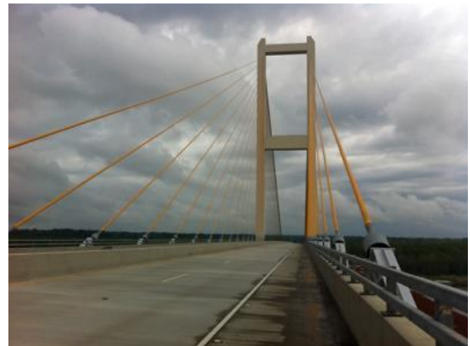
Saint Francisville Bridge crossing the Mississippi River