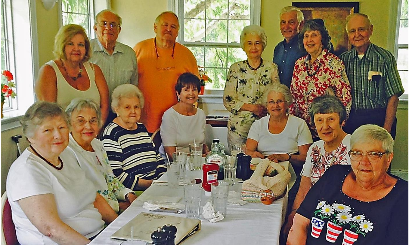
Southeast Pennsylvania Retirees' July Luncheon.

Our winter meeting will be in November or December, same time, same place, with the date TBD.