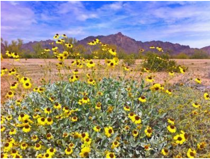
More Beautiful Scenery!