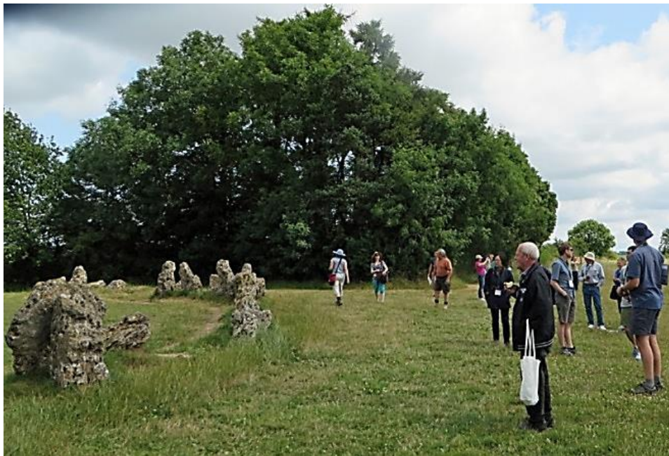
Field Tour at Rollright Stones