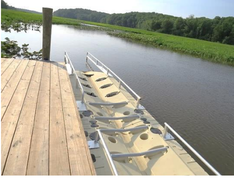
Canoe/Kayak launch, Accokeek Creek, VA (specifically designed for the disabled)