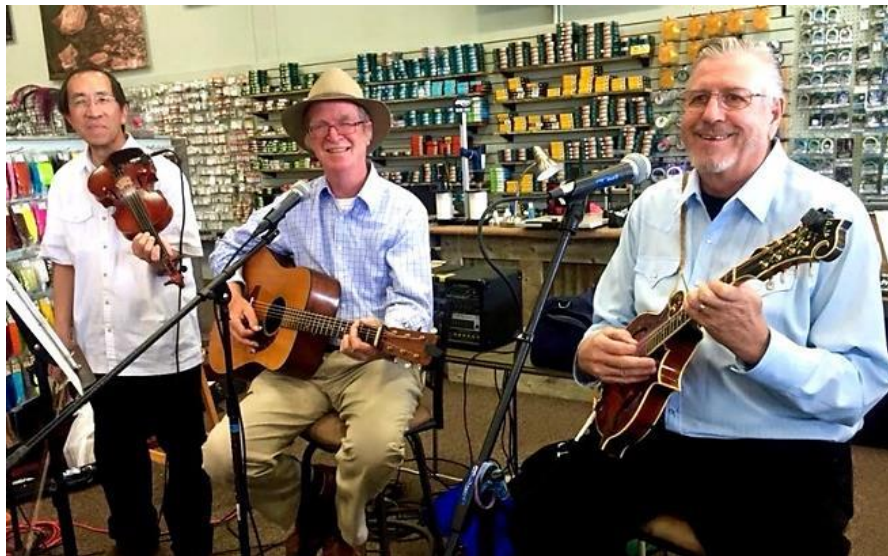
The Western Lights Trio playing at the local fly shop

I have been keeping very busy playing music as a member of the Western Lights trio with quite a diversity of playing venues. Most recently we provided music for a wedding and before that we played for a bunch of fly fishermen at our local fly shop.