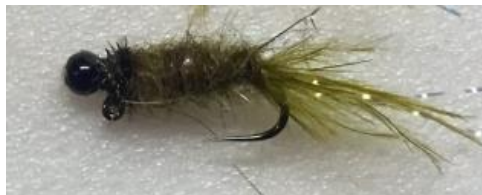
Olive Damsel fly

I have been trying to get out and do some fly fishing and even tie some flies in anticipation of some upcoming fishing. Darwyn Briggs and I recently did a half day float trip on the American River catching some very small stripers that were not worth even taking a picture of. I have been tying some flies in anticipation of an upcoming vacation, and here is a sample of some of my recent fly tying.