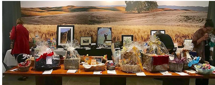
Matchbook Winery Silent Auction table