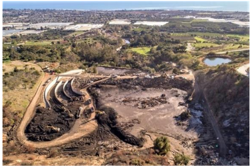
Santa Monica Debris Basin, February 14 th , 2018, emergency cleanout work

And now just in time for the newsletter, $4.7 million in funding was actually approved and allocated allowing for technical assistance work to begin immediately for final design work and development of plans and specifications for the approved remedial measures. The award of a Contract for construction of the remedial measures is expected in 2020.