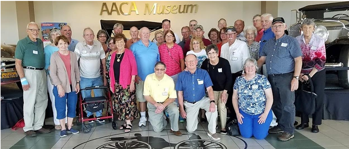
Pennsylvania Retirees gathering: We concluded the event at the Antique Automobile Club of America Museum where there were numerous Studebakers among the antique automobiles on display; lots of memories! Thanks to all who made this happen.

scholarship since he has two sisters, one in college and one a recent graduate of Penn State and so the financial burden is heavy for his family.