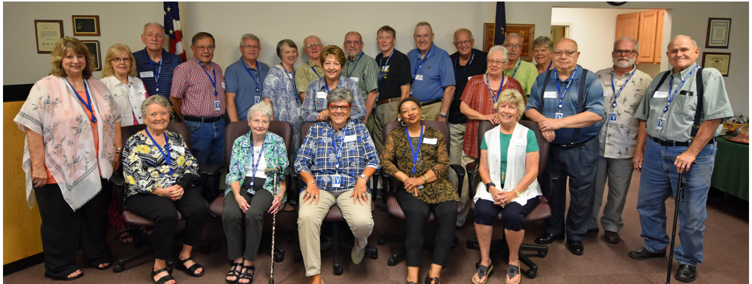
Indiana Retirees Meet