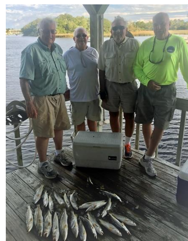
Four hardy fishermen with days catch