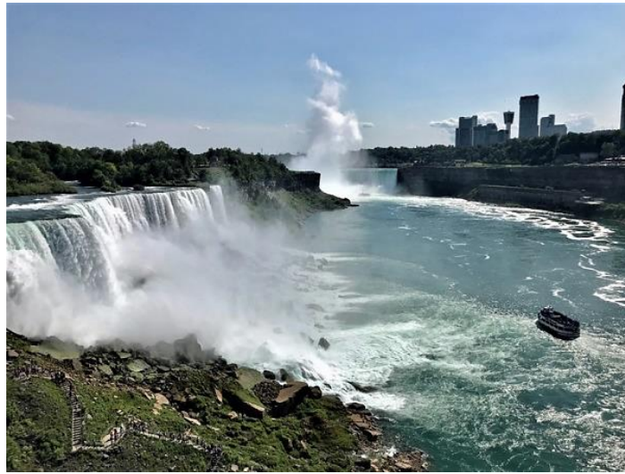
Niagara Falls in all its beauty!