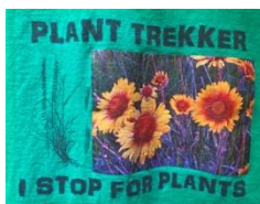
Attire for high traffic zones

For a week they inventoried plant communities at Bandelier National Monument, Valles Caldera National Preserve, Mount Taylor, El Malpais National Monument, Bosque del Apache National Wildlife Refuge, Valley of Fires Recreation Area, Bitter Lake National Wildlife Refuge, Karr Recreation Area (near Cloudcroft), Organ Mountains Desert Peaks National Monument, and the NRCS Los Lunas Plant Materials Center (PMC).