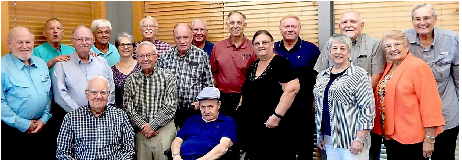
ARKANSAS SCS/NRCS Retirees Fall 2019