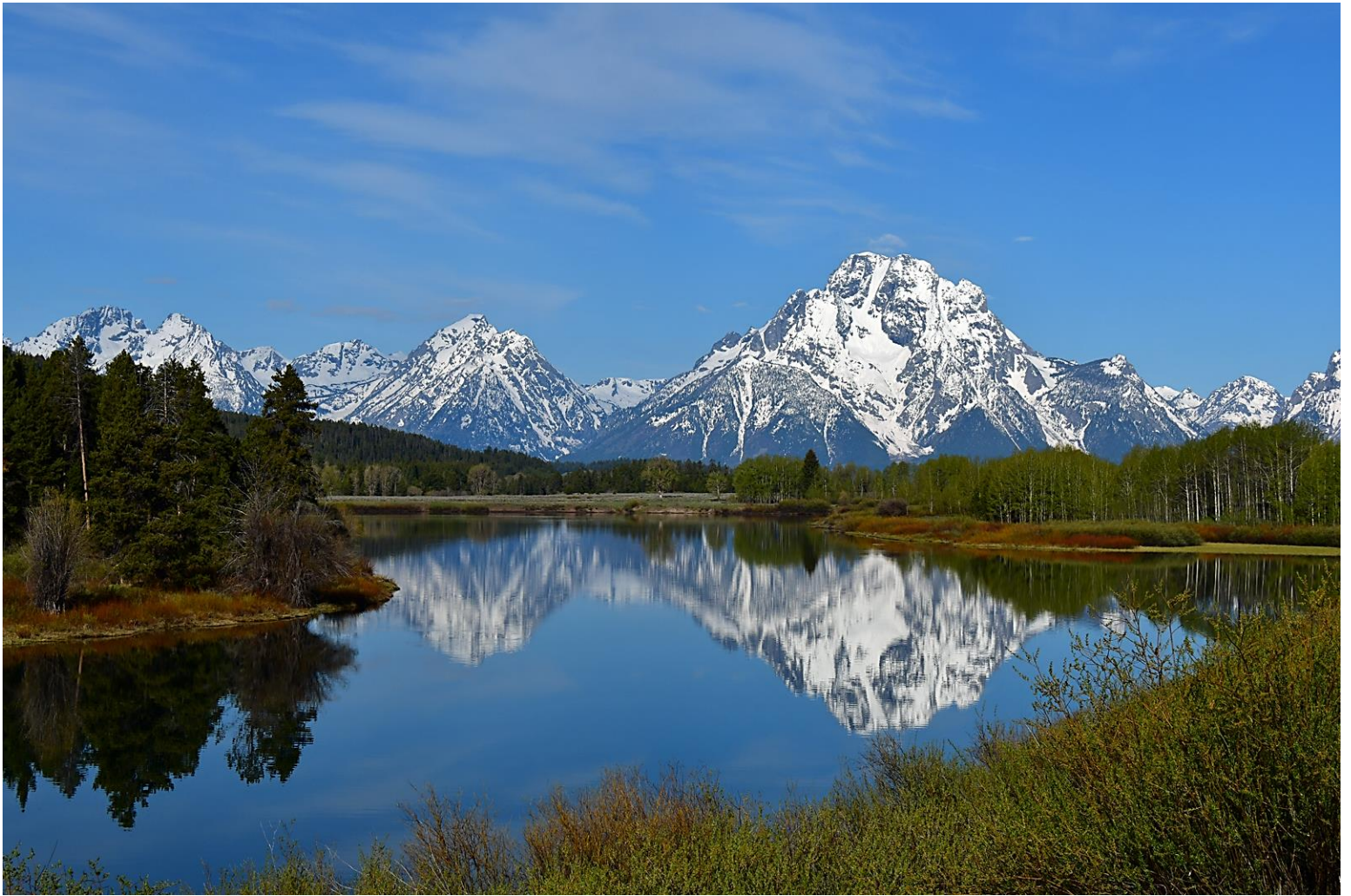
Reflections of the Grand Tetons, WY