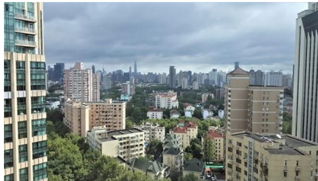
Shanghai, looking out hotel window

"I stayed involved with the local conservation movement serving as Executive Director for the California Association of Conservation Districts (CARCD) from 1997 to 2005. I have served on the Local Placer County RCD for the past 14 years and served as State President of CARCD 2006 to 2008. I am still involved with the National Association of Conservation Districts (NACD) serving as California's Board member for seven years and am presently serving as the Pacific Region representative on the NACD Executive Board."