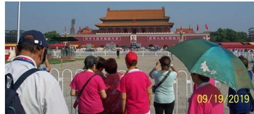
Tiananmen Square and Forbidden City