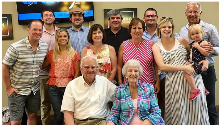
In July their Seattle area grandchildren with a great-granddaughter came for another Mashburn family get-together.