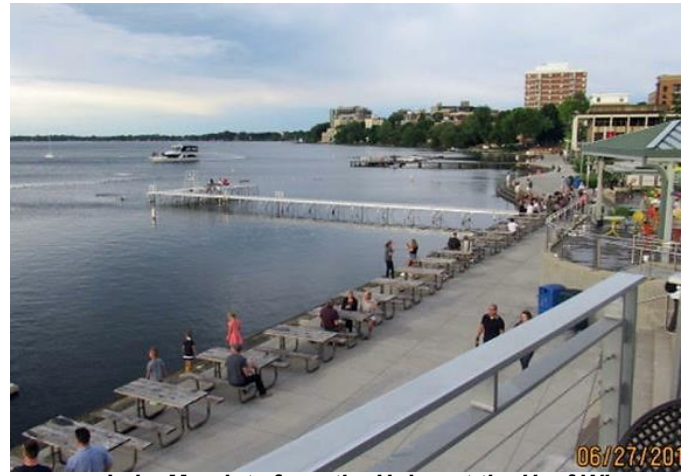
Lake Mendota from the Union at the U. of WI

Then on to Davenport to visit some friends and on to the University of Wisconsin where I had my bratwurst and beer on the lake shore at the Union patio.