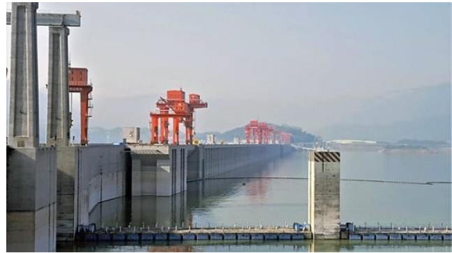
Three Gorges Dam