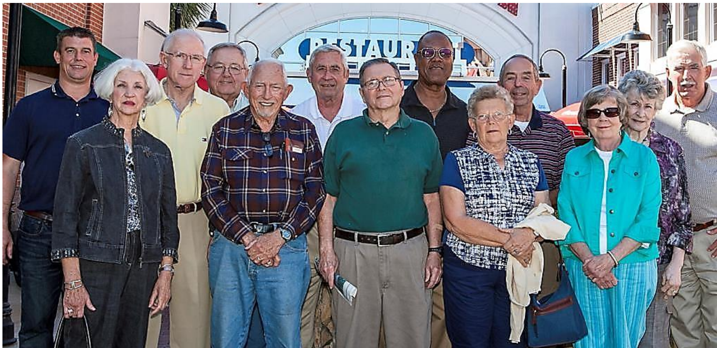
South Carolina ARCSE Members at their retirees' meeting

South Carolina retirees appreciate the concern of others who have called our members in South Carolina who may have been impacted by the storm that struck the state. We are happy to report that, to our knowledge, none of our members were severely impacted by the flooding. Several of our members have been assisting with recovery and providing technical advice. We have some 70 dams that were breached or are severely damaged and will require major renovating or replacement. None of the NRCS dams had major issues, although some had the emergency spillway operate for the first time and may need some repair.