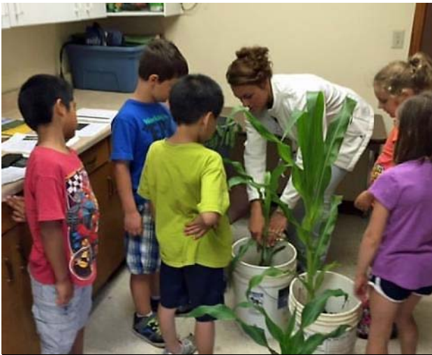
ISU student showing Pizz-A-Thon kids the various stages of corn growth and the importance of soil and water conservation.