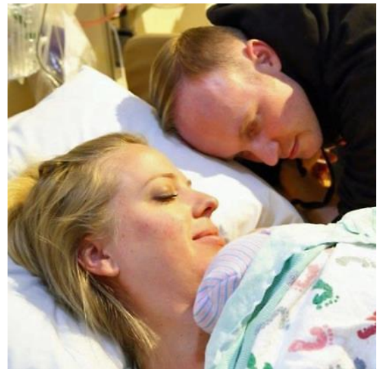
Mom and Dad with their new baby Boy