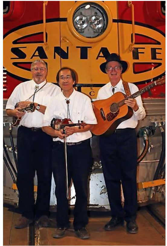
The Western Lights Trio at the California Railroad Museum

Following is a link to the University website describing all aspects of the week-long conference. From this site you can go to "Event Photographs" and see many university photographs from the entire week-long conference, including their photos taken on the night we performed at the railroad museum.