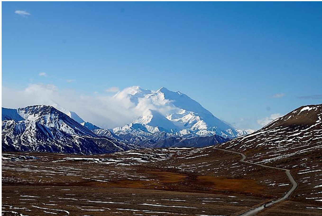
Mt. Denali, Alaska