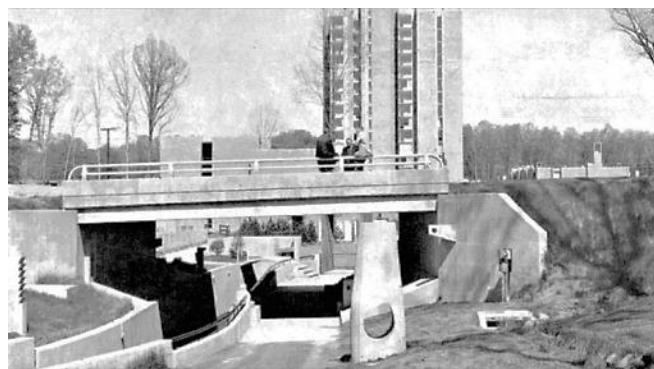
Reston, VA . . . city with a conservation plan

After building a 35-acre lake, planned with SCS technical assistance, as a focal point for the new business and residential area, Reston developers went on to establish a number of other conservation measures. They include (1) a nursery to save thousands of plants that would otherwise be destroyed during construction; (2) the planting of some 30,000 tree seedlings on abandoned and eroded farmland; (3) an excellent water-disposal system ranging from elaborate storm sewers to simple grassed waterways; (4) bridle and fire trails with conservation features; (5) a comprehensive plan for the management of forest lands (Reston has a professional forester on its staff); (6) an elaborate irrigation system for the area; (7) nature centers and the improvement of wildlife habitat by planting special food and cover plants; and (8) a continuing lake management program.