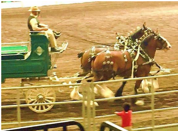
Draft Horse competition at the Iowa State Fair.