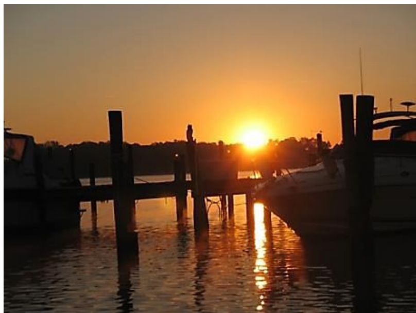
Sunrise on Aquia Creek, Stafford, VA

DEADLINE FOR JAN/FEB 2016 NEWSLETTER CONTRIBUTIONS IS DECEMBER 25, 2015