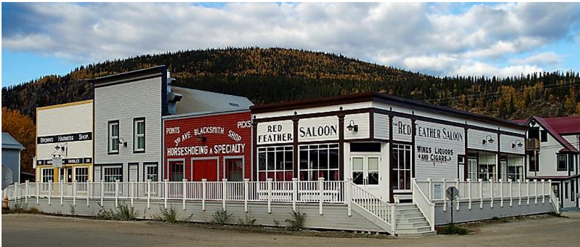
Street scene in Dawson City