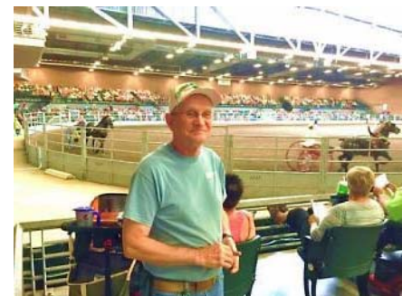
And later in the day working one of the entrances to the Draft Horse Show.