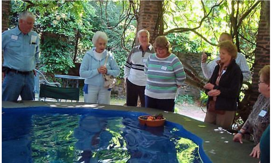
Attendees marvel at Pinchot's unique outdoor dining table.