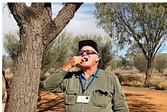
Eating kangaroo tail from the barbie in the Australian Outback.