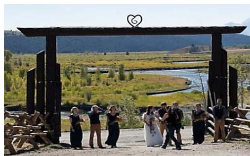
Heart 6 Ranch Entrance