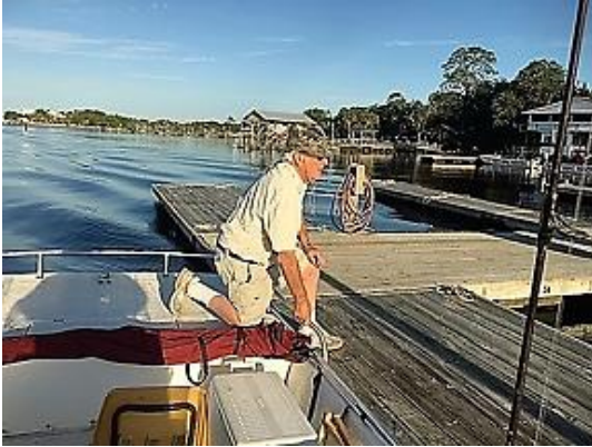
Come on guys, it's noon already!