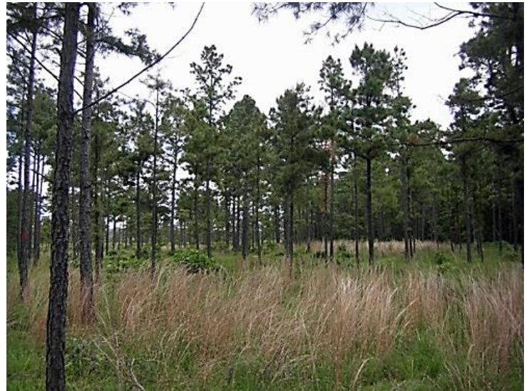
Shortleaf pine-bluestem demonstration plot on Pushmataha Wildlife Management Area, Pushmataha County, Oklahoma (photo from OK Forestry Services).

This skeletal history demonstrates that those trying to influence pine planting, such as the Short-Leaf Pine Initiative, operate in an economic climate that changes more rapidly than we often expect.