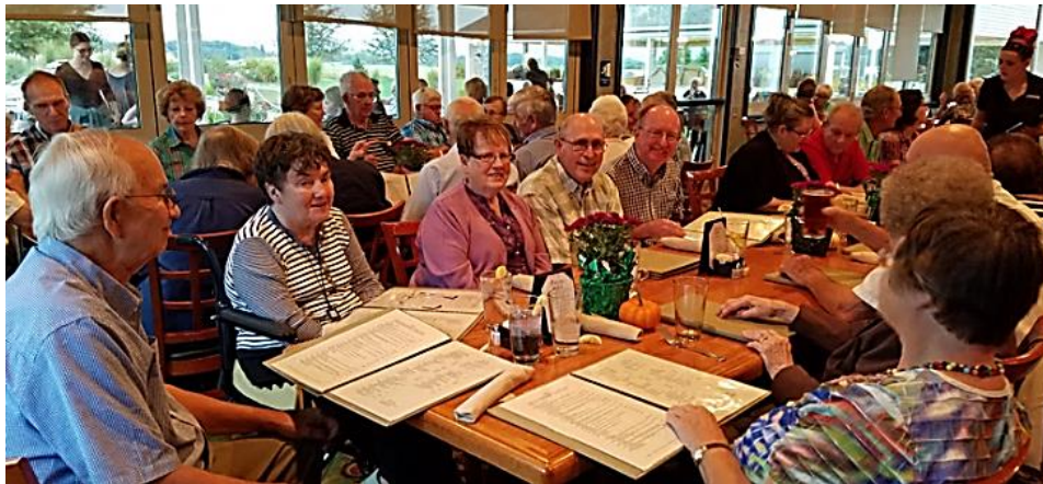
This Sunday evening event is becoming a very popular time to gather together