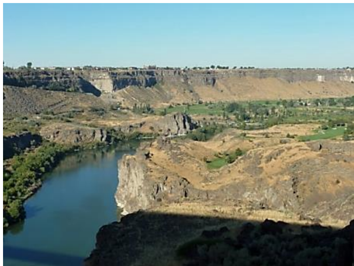
Snake River Canyon by Twin Falls, Idaho