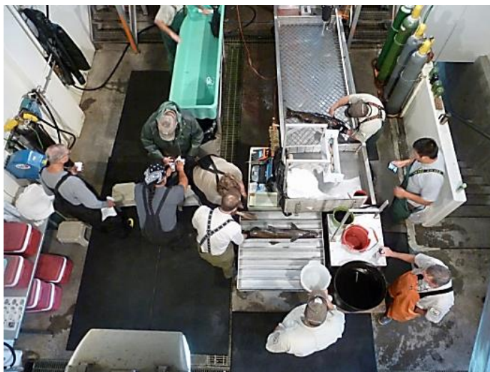
Milking Salmon Eggs at the Dworshak Dam Fish Hatchery

After getting home, mowing yard, doing laundry, canning tomatoes, etc., we boarded a bus to head to Washington, DC. Some of the highlights of this trip included Arlington National Cemetery, the Nation's Capital, several of the Smithsonian buildings, Mount Vernon, and many of the monuments and memorials. A stop by the Flight 93 Memorial on the way home was a sobering reminder of the events of 9/11. Now I'm ready to stay home for a while!