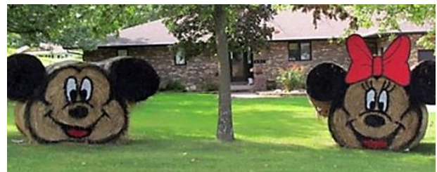
Mickey and Minnie