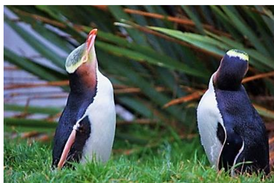
Yellow eyed penguin near Dunedin, New Zealand