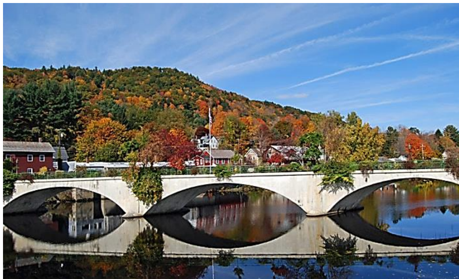
Bridge of Flowers, Shelburne Falls, MA

We drove west one afternoon on the Mohawk Trail from Greenfield to the villages of Shelburne and Buckland. These towns are connected by a foot bridge over the Deerfield River. Known as the Bridge of Flowers , both sides of the path are planted with a variety of beautiful flora. We had not walked on the bridge before, a unique experience!