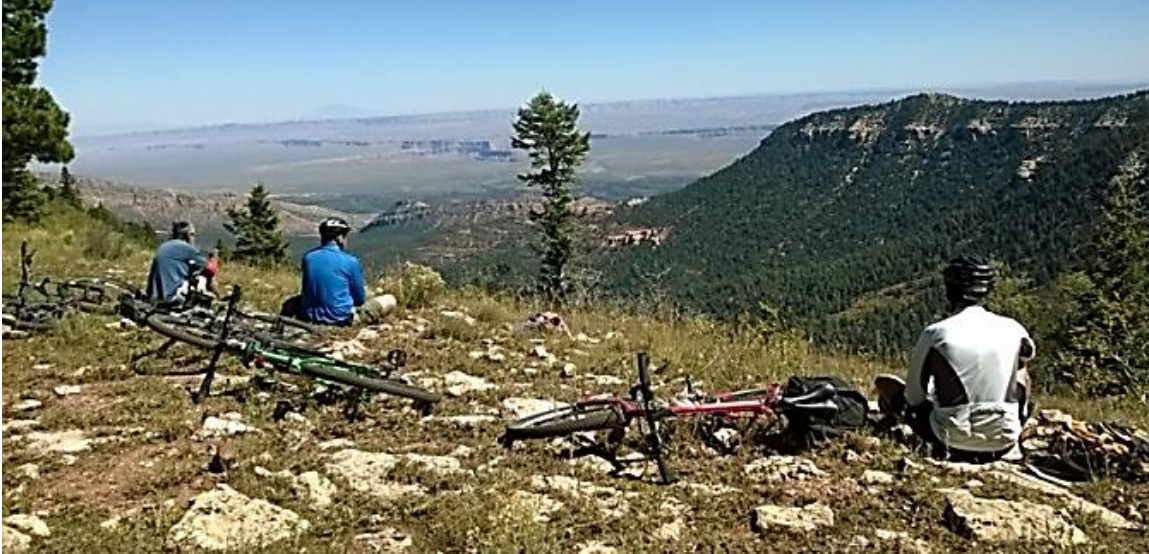
HAWS lunch stop on the Arizona Trail