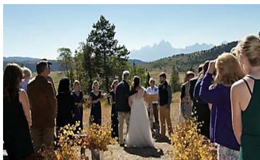
The Wedding "Cathedral"