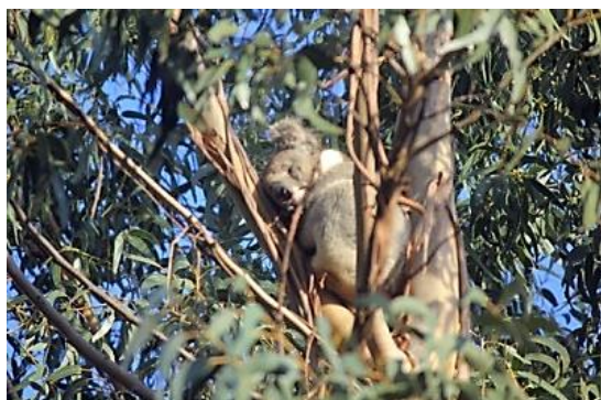
Sleeping Koala on Kangaroo Island, AU

Daintree, and Cape Tribulation. One of the highlights was seeing a male Cassowary with juvenile in the wild. Cairns AU: Ag food tour of coffee, wine, dairy and macadamia nut plantation. Highlight for me was petting a wombat and koala at Night at the Zoo in Cairns. Kakadu National Park near Darwin AU. Rock art on the Ubirr hike a trip highlight, billabongs and the sunset yellow river cruise--bird life and crocs. Alice Springs AU: cattle station tour, parrots and Uluru. Kangaroo Island: wildlife galore--seals, sea lions, koala, wallaby, kangaroos, echidna, cape barren geese, macaws, cute possums, gum trees and sheep. Queenstown, New Zealand: jet boat, steam boat, Milford and Doubtful sounds. Stewart Island: bird life; Dunedin forested yellow eyed penguins. We also saw the little blue penguins and Fiordland crested penguins, all forest-type penguins. Near Christchurch, we visited a heritage breeder of kune-kune pigs and other heritage breeds of sheep, goat, chicken, and rabbits. North Island, New Zealand: we learned about the Maori culture in Rotorua, visited the worm caves, and last stop was Auckland, where we did a wilderness tour and visited Kelly Tarton's sea life. We were there in winter, and yes, we did have a few snowy days while on the south island. We stayed away from towns; main objective to see wildlife, landscapes and agriculture.