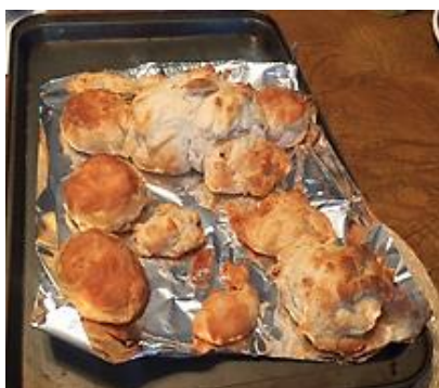
Biscuits in the morning