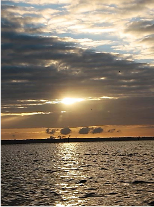
Fall sunrise on Aquia Creek at Potomac River, Stafford, VA