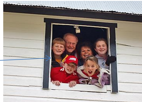
"A View From the Window."

The window was cut out large enough to back the elevator into that opening for elevating bales into the mow. It was also large enough for the cow that went up the steps to the hay mow and jumped out this window.