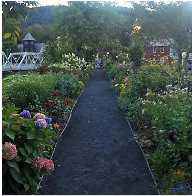
Bridge of Flowers, Shelburne Falls, MA