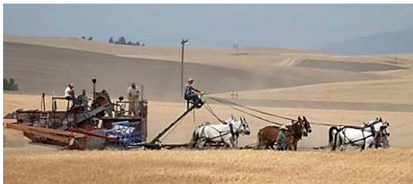
12-Mule Hitch Pulling an Antique Combine at the Vintage Harvest Festival