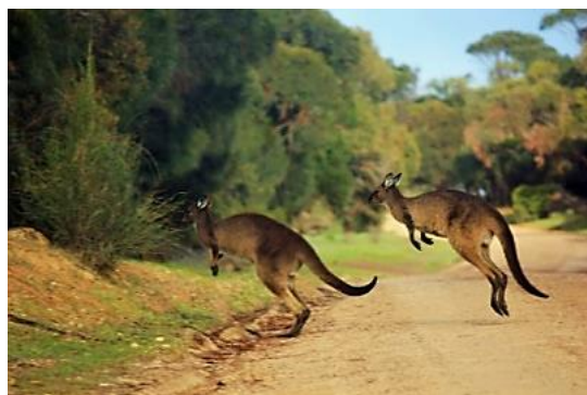
Kangaroos on Kangaroo IS