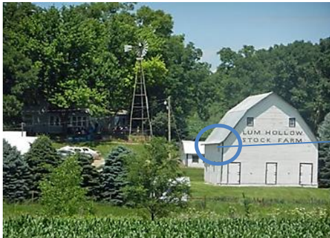
The Lum Hollow Stock Farm Barn