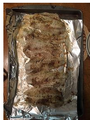
Fresh fish in the evening