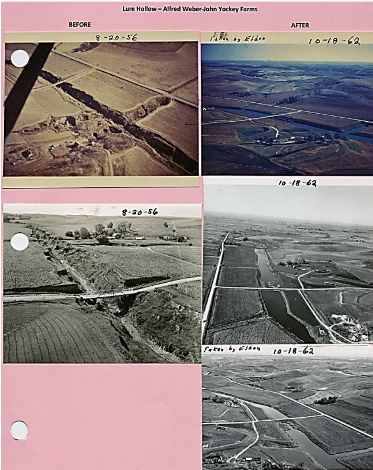
Lum Hollow Watershed "Before" and "After" Pictures