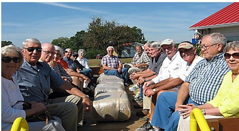
SC Retirees at Strawberry Hills Farm, October 20, 2016