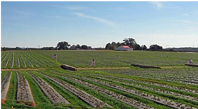
Bedded plants - Stone walls in waterway

The farm in the upstate of South Carolina was purchased in the early 1900s to farm cotton. Following WW II, peaches became the primary crop. About 1,000 acres are presently in peaches. In 1995, six acres of strawberries were planted to diversify the operation which has grown to be the largest strawberry operation (115 acres) in the state. In 2007, 36 acres of blackberries were added to the farm. Summer squash, cucumbers, cantaloupes, and pumpkins are also grown.