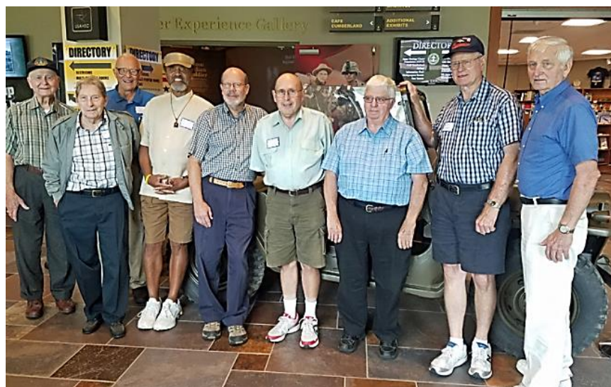
We honored our veterans and thanked them for their service.