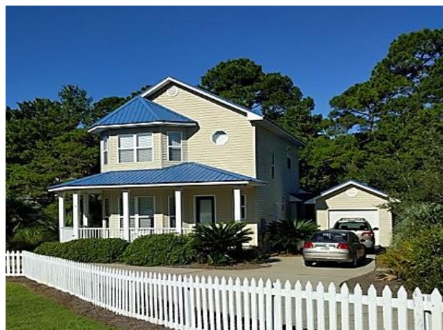
Bill Kuenstler's new house

The temperatures are getting a little cooler. I always step out onto the back porch while my coffee is brewing, and it has been noticeably cooler the past few mornings, in the low 70s instead of upper 70s. And the humidity is down a little as well, which helps. Tropical Storm Hermine pretty much bypassed us, fortunately. We had one cloudy day and about 0.2 inches of rain, and that was it. There was some minor beach erosion to the east of us, around Panama City. The Tallahassee area took the brunt of it, mostly with downed trees and branches knocking down power lines. Right after the storm went through, there were +/- 100,000 people out of power, and 3-4 days later there were still 50-60,000 out. They pretty much had to rebuild entire stretches of power lines, since the wires were broken in so many places, and most of the poles were broken and/or blown down. A picture of the Kuenstler home is shown." Arnold King's comment: A Beautiful part of Florida, are you taking reservations for next spring?