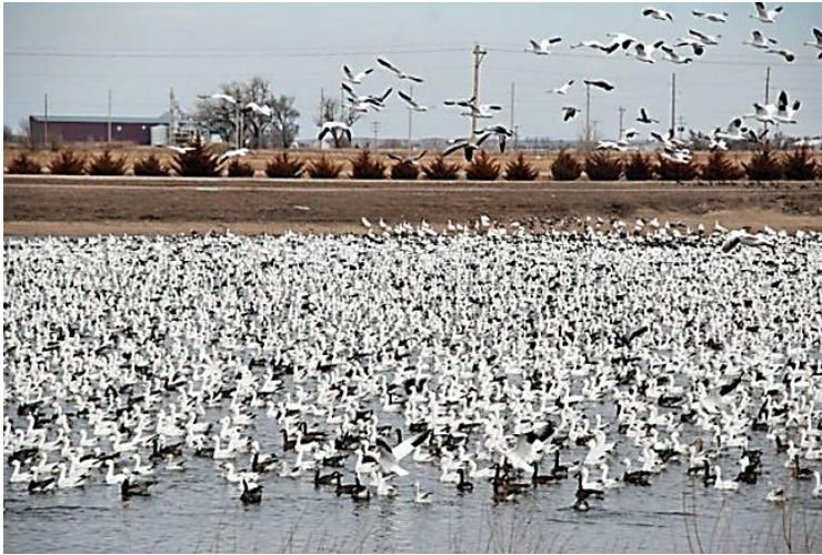
Snow Geese in Nebraska