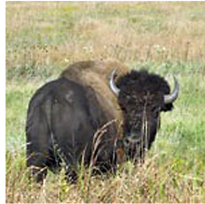
Bison in the Tallgrass Prairie National Preserve, Kansas