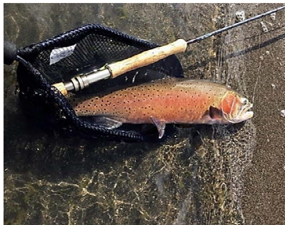
Many more fish like this cutthroat trout were caught, and all fish released!

https://youtu.be/-vywBmKdzP0?t=4 : Bill and Brian's Pyramid Lake Fishing trip Video!