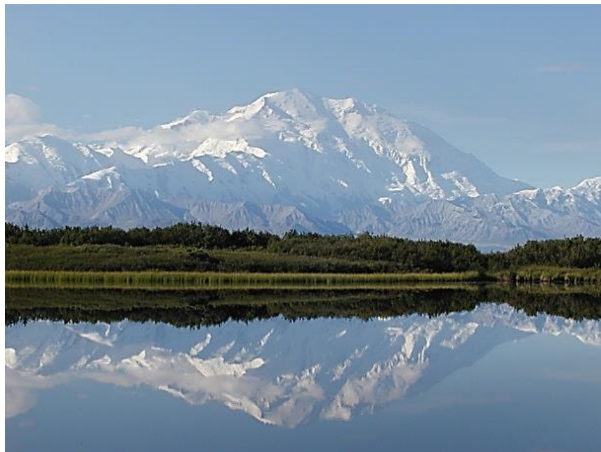
Reflection Pond, Denali National Park, Alaska.