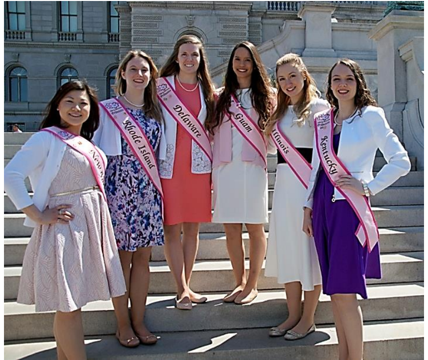
National Cherry Blossom Festival Princesses