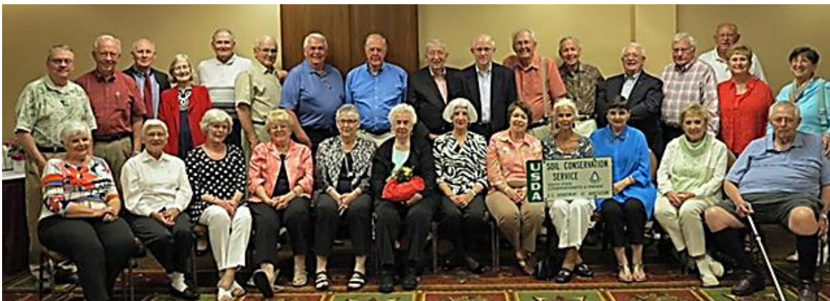
South State Conservationists and Friends annual gathering, Fredericksburg, VA April 24-27