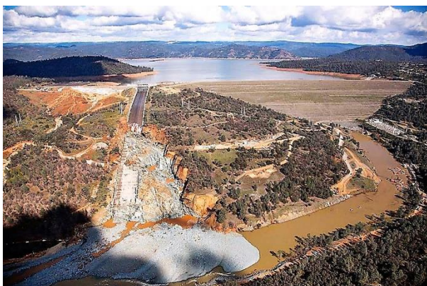
Debris plug prior to removal operations