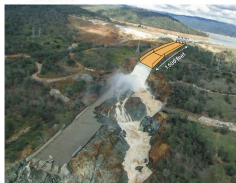
Recovery plan design Concepts

That's all for this time around folks. Wishing you all the best from California!