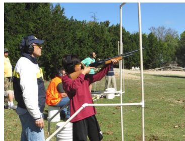
12 and 20 gauge shotgun shooting