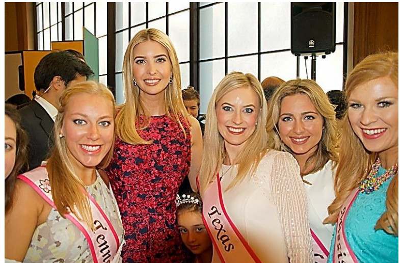
Ivanka Trump with Princesses. Florida, partially hidden, was wearing one of Ivanka's designs.