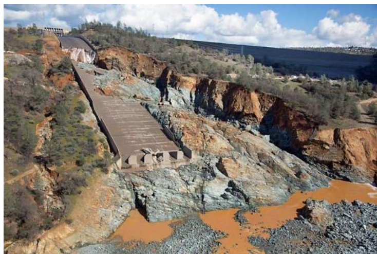
Primary Spillway April 2017