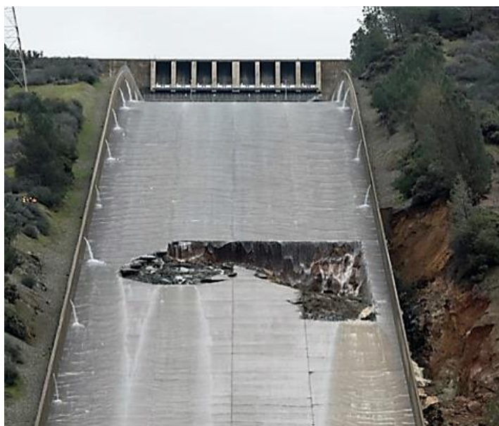
Initial Damage, February 12, 2017

Following are some photos going back to February 12 th when the spillway gates were turned off to inspect the initial damage, through more recent times.