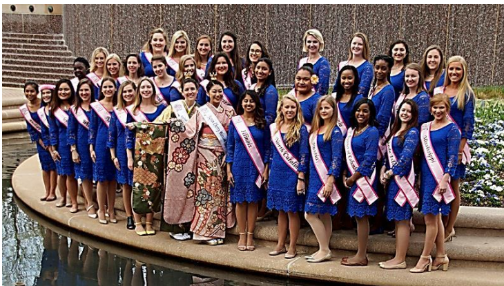
Class picture by the Crystal City Park fountain.