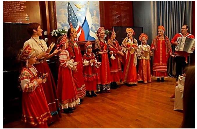
Dancers at the Russian Cultural Center.