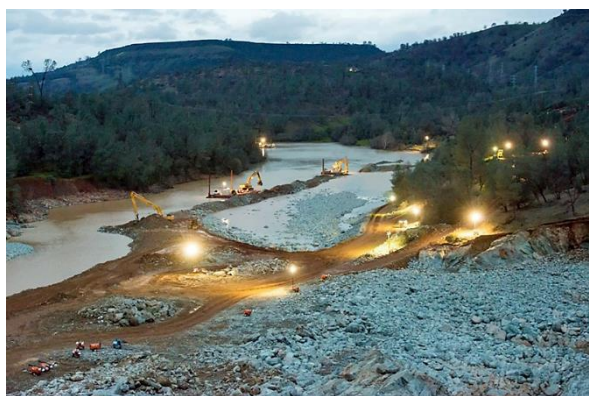
Around the clock Debris Removal