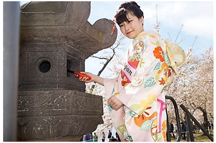
Japan Princess Tamako Okano lighting the 400 year old lantern on the Tidal Basin.