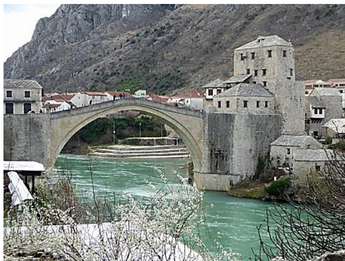
Old Bridge (Stari Most) in Mostar, Bosnia-Herzegovina.