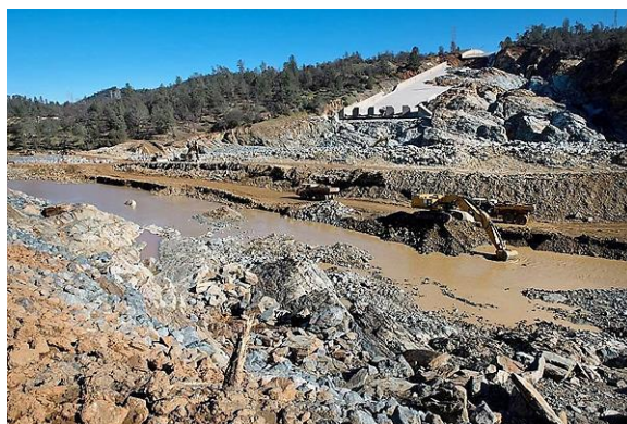
Debris Removal operations