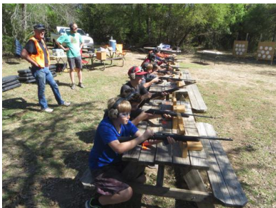
.22 Caliber rifle shooting