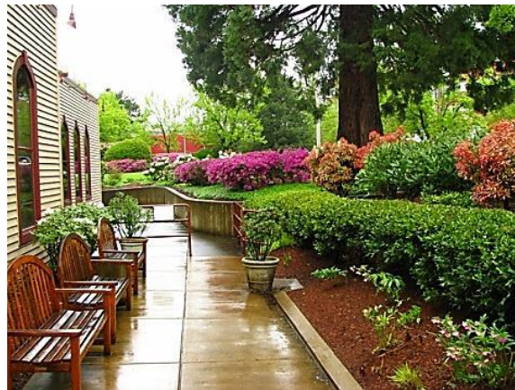
Rain-swept walkway at The Old Spaghetti Factory with blooming azaleas.