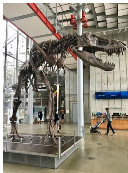
The "guard" immediately inside the Academy

That's all this time around Folks, Best Wishes from California!