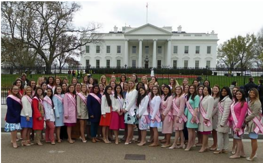
Princesses at White House