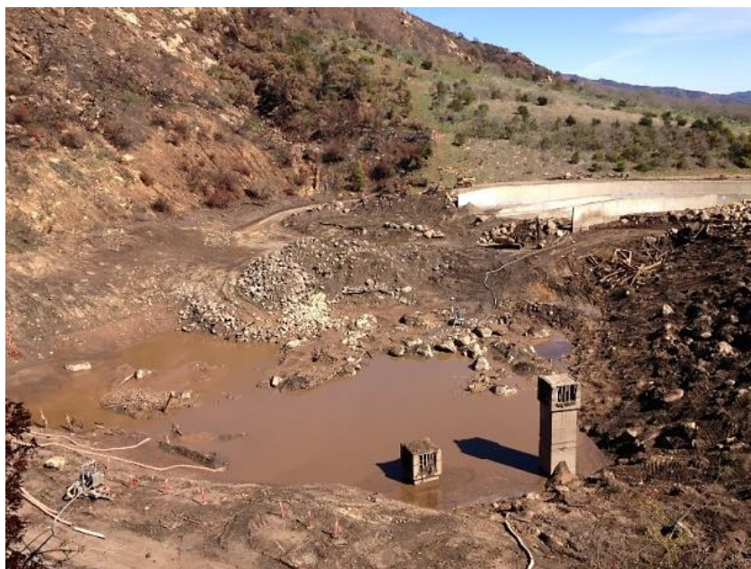
3/5, Dewatering after a storm.

The repairs and modifications requested for Santa Monica Debris Basin are part of Santa Barbara County's plan to be vigilant and ready for the foreseeable future. $20 million has been expended, with more work yet to be done.