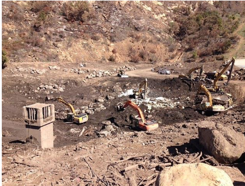
2/23, Santa Monica D Basin, excavation of debris and boulder. Note two towers exposed and one still buried.

Doug Toews documented progress in the following photos.