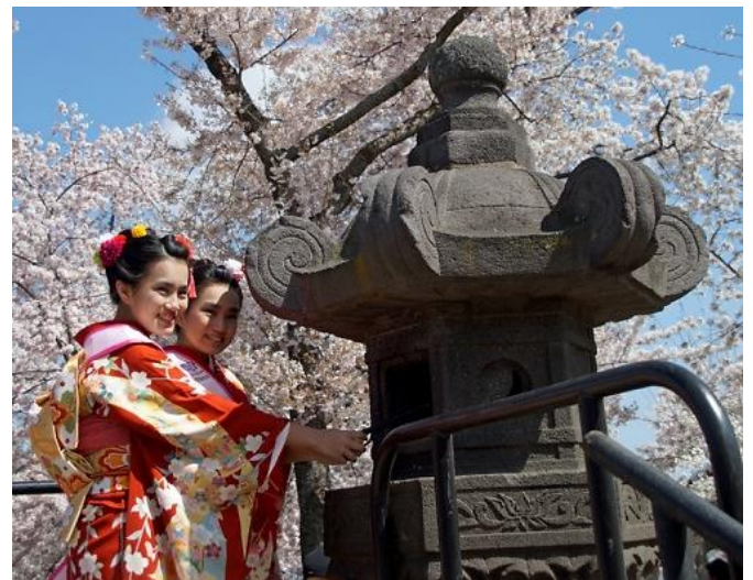
Japanese Princesses (Twins) lighting lantern