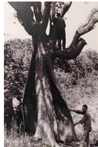
Early picture of Cork Harvest in Portugal

I know that many retired employees travel, so please share and send pictures of what you found interesting with the rest of us in this newsletter. Following below is information about our next annual meeting the end of July at SWCS in Albuquerque NM. Mark your calendar now! We would love to see you there.