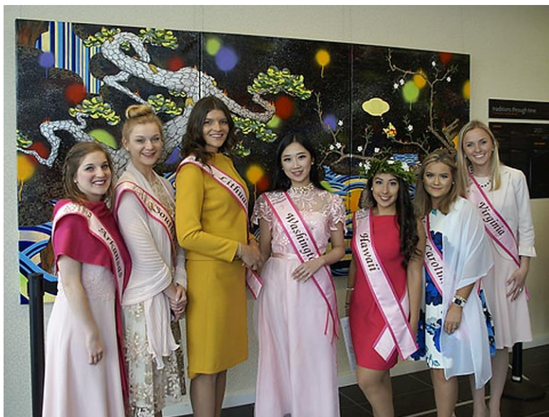
Some of the Cherry Blossom Princesses