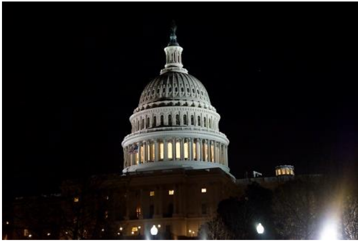
Night view of our Capitol.