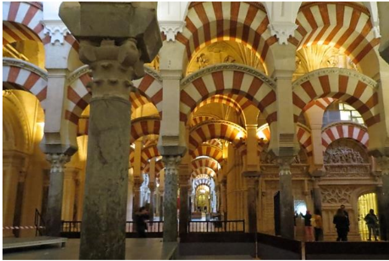
The Masquita in Cordoba, where a Christian Cathedral rose up in the midst of a huge Mosque.