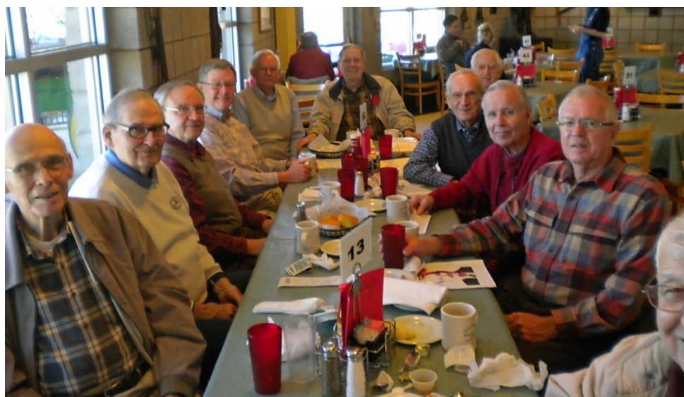
North Carolina Retirees meet for breakfast