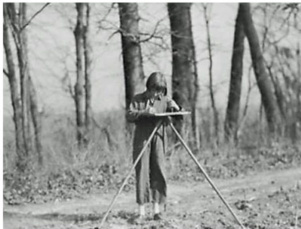
Marie assisting her father surveying soil