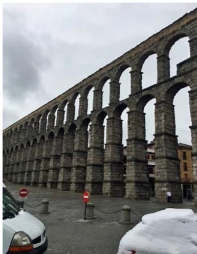
Roman Bridge Aqueducts. Water ran across top to a cistern in the town (note snow on cars).

Most of the areas are fairly arid with very rocky soils, so irrigation is a major part of providing water to orchards, vegetables, and fields. We saw the earliest efforts of providing water being from Roman Aqueducts built starting in 500 BC to terraced fields, with ditch irrigation and overhead irrigation being necessary to produce their crops. The air was fragrant with the smell of orange blossoms in about every town we visited. In Portugal I was lucky enough to meet the Minister of Agriculture who took me through a tour of an exhibit about their last 100 years of agriculture. They showed off the use of the latest technology of drones, robots, and computer-controlled monitoring of fields for irrigation. Especially interesting was the harvest of cork. Portugal produces 70% of the world's cork. While visiting towns in the north of Spain, they were getting freak snows; and in Bilbao while we were there, they received more rain in one day than they normally receive in a year! It was certainly the talk of the day since major flooding occurred. The discussion of climate change challenges was certainly a topic of many of the agriculture professionals I met.