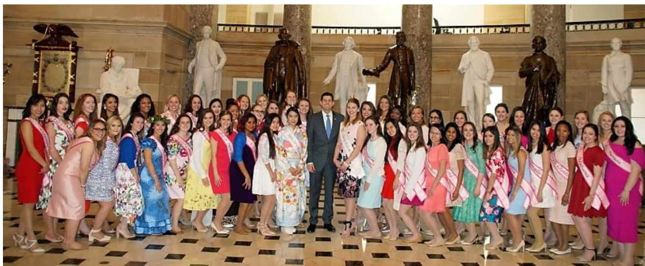
Cherry Blossom Princesses with Speaker Paul Ryan.

Interesting thing happened when photographing Speaker Ryan. I got everybody lined up and he came in and slipped into position. Then his photographer popped up right in front of me. So I told them to get back in position so I could get my shot. So Ryan reluctantly got back in position as said I yield to the man in the bow-tie. First time I've told a Speaker of the house what to do.