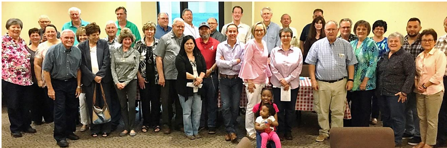
Many retirees met at the NRCS Federal Credit Union Annual Meeting in Crowley TX April 12, 2018.