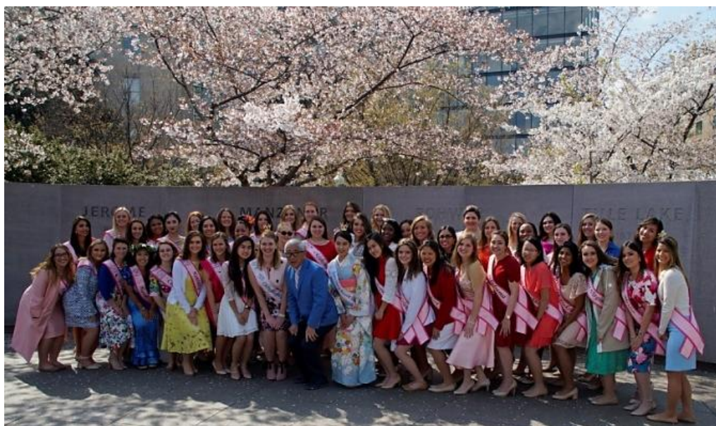
At the Japan American Internment Memorial.