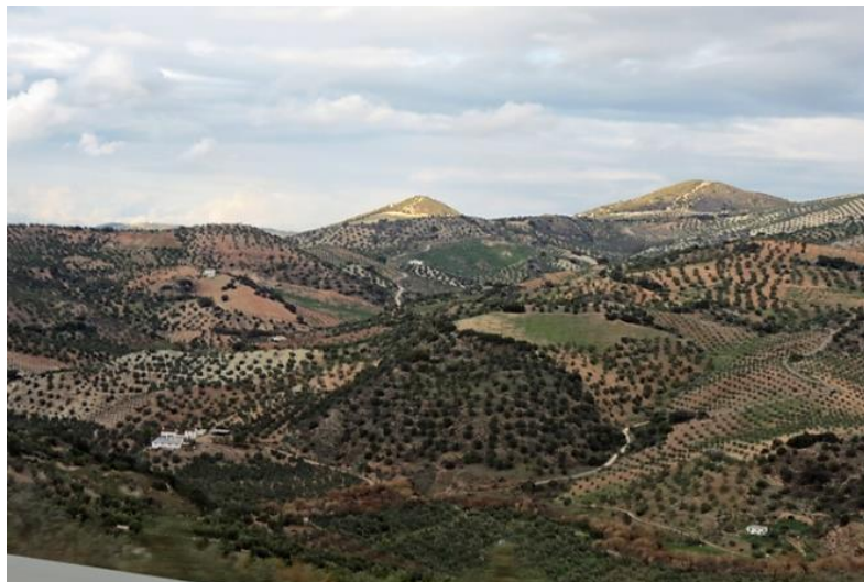
Second photo shows olive trees as far as one can see in Andalusia.