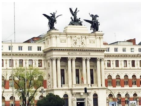
Ministry of Agriculture, Madrid, Spain.