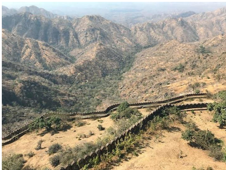
The great wall of India. Not a bad looking wall at all!