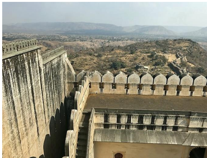
Kumbhalgarh Fortress, Rajasthan, India