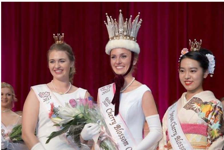
2017 queen, 2018 queen and 2018 Japan queen