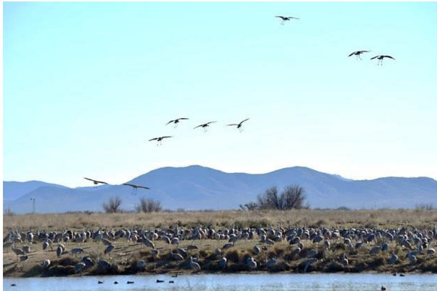
Sand Hill Cranes at the Willcox Playa, Arizona.