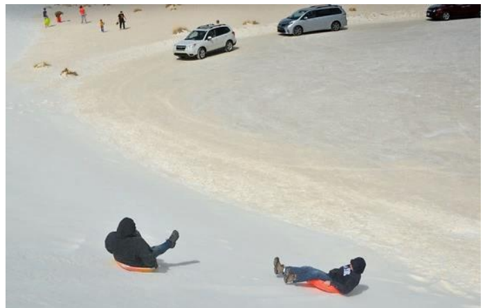
White Sands National Monument

We look forward again to a summer schedule of teaching at three or four Vacation Bible Schools and seeing my youngest son and his family in Olympia, WA. Hope to make some stops at Arches and Canyonlands in SE Utah on the way home!