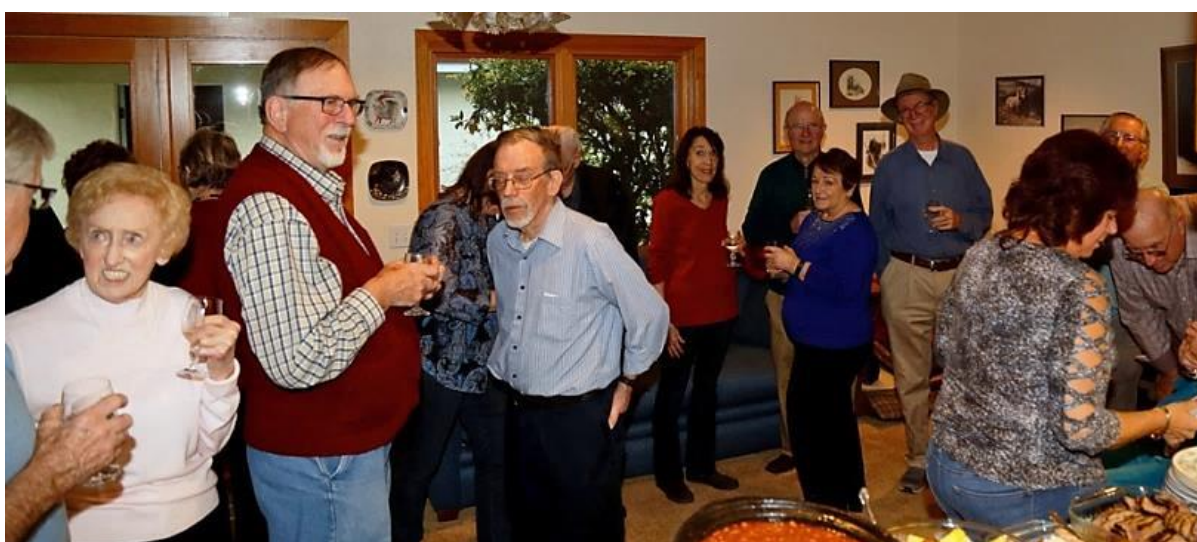
A Group Photo before eating