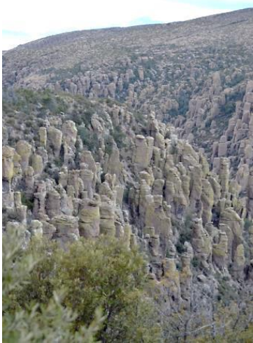
City of Rocks State Park, New Mexico