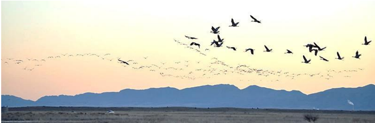
Sand Hill Cranes at the Wilcox Playa, New Mexico.

hood of the pickup and an icepack under the windshield wipers. Needless to say, we decided not to “stick around” and returned to the valley and back to Cruces.