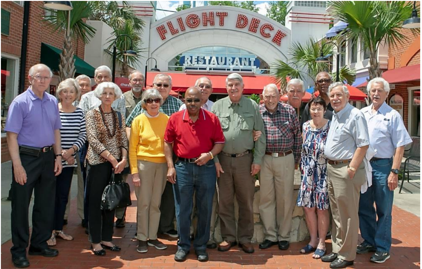
The South Carolina NRCS Retirees met April 18 th in Lexington, SC. Following many updates and stories (the older we get, the better we were), and a Dutch treat lunch, a representative from Meals on Wheels explained the local county program.