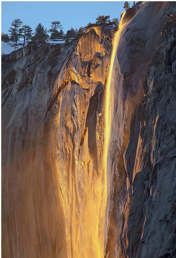
Fire Falls, also known as "Horsetail Falls," Yosemite NP