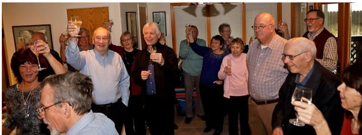
Cheers to all in attendance!