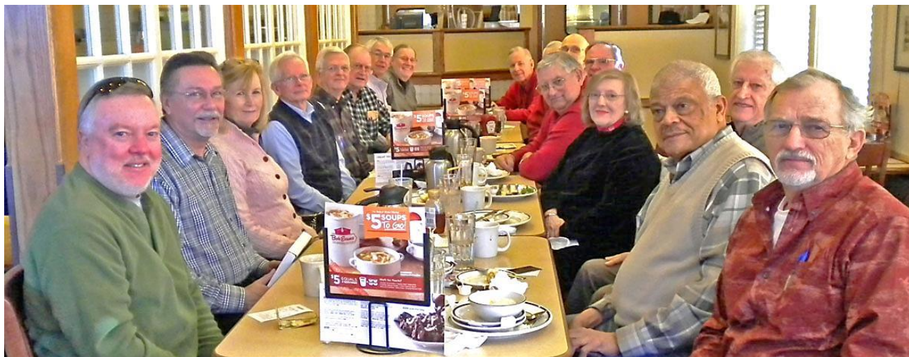
North Carolina retirees' breakfast in Raleigh.