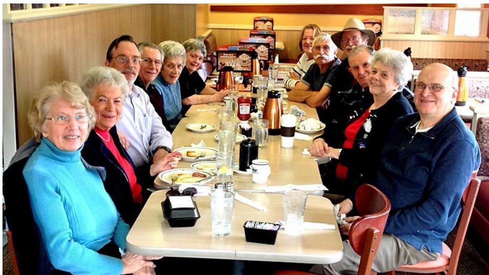
California Retirees at January luncheon