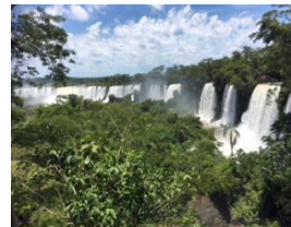
Iguazú Falls, Argentina