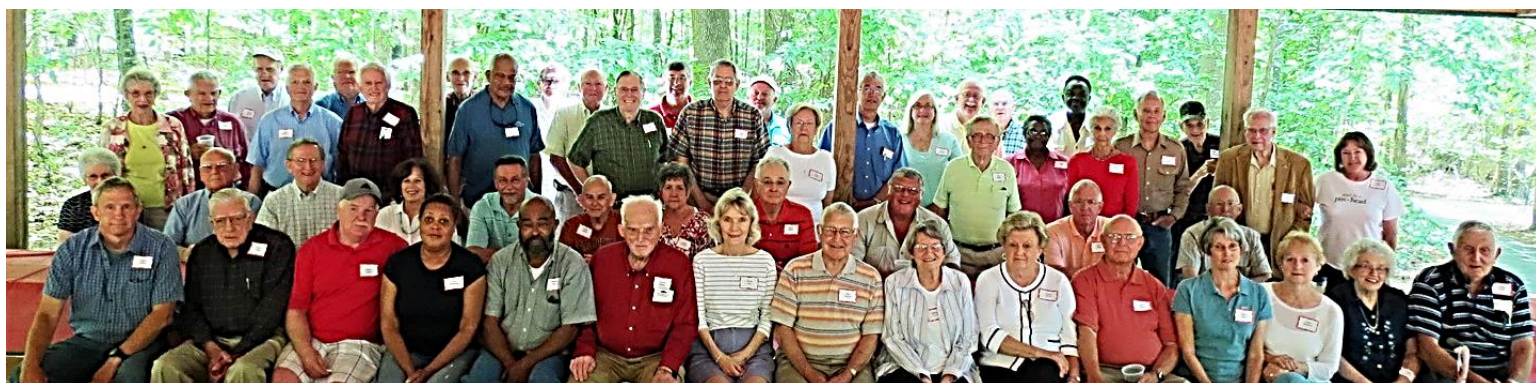
North Carolina Retiree's Picnic, May 8, 2014.