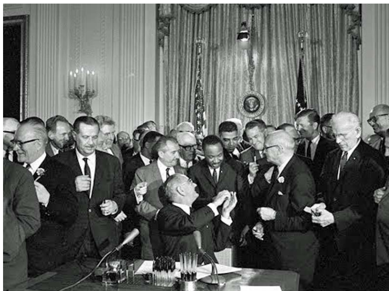
President Lyndon Johnson and Martin Luther King at signing of the Civil Rights Act of 1964.