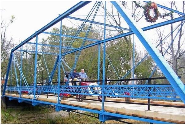
Final product 7 years ago, called the Blue Bridge, looked like this when we finished the decking.