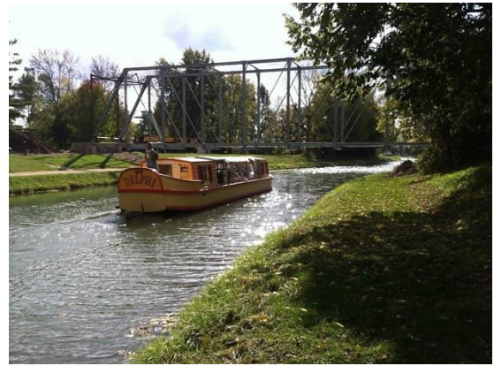
The repeat of what we did years before came to us at our Spring Workday this year as when we decked an even longer restored iron bridge in Canal Park.