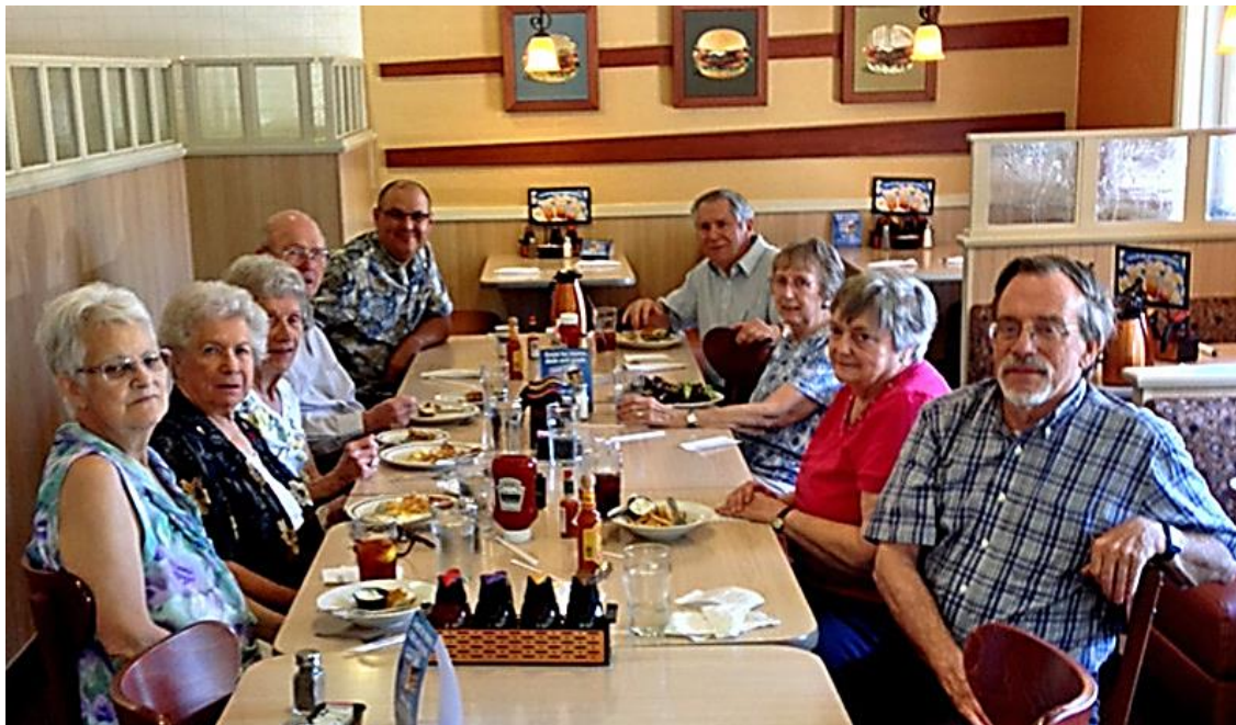
California Retirees at June 4 th lunch.

Our California retirees continue to enjoy a first Wednesday of the month lunch and a third Wednesday of the month breakfast for folks to get together and catch up with the latest on what is going on in our group. The photo below shows the 10 people who made it to the June 4 th lunch.