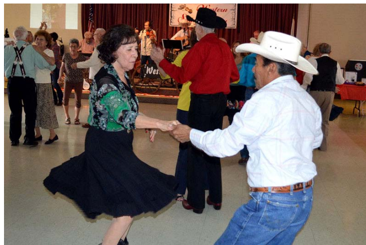
Dancers doing what they love to!

Have a wonderful summer and best wishes from all the California retirees!