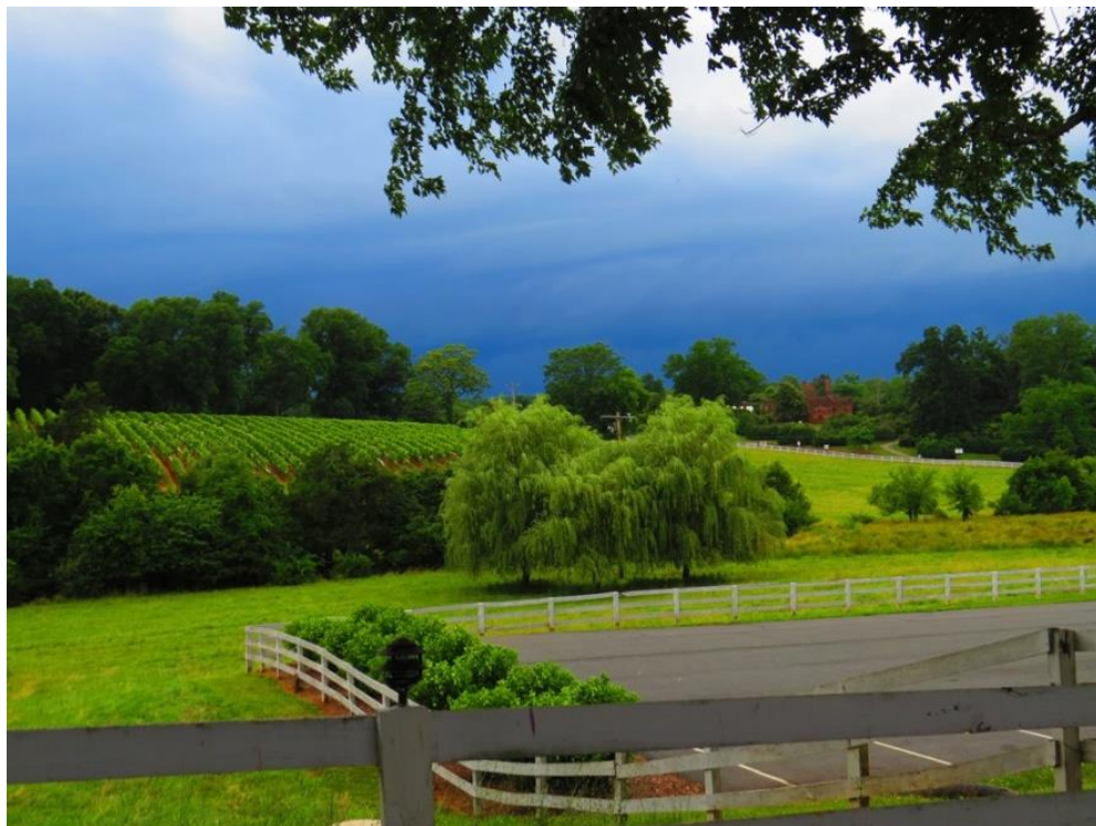
Barboursville ruins and vineyards, Orange, VA