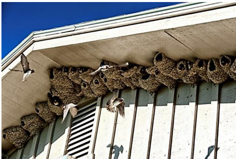
Cliff swallows at the Gooby Ranch.