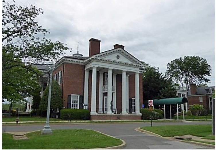
Fort McNair Officer's Club, Washington, DC.

Once all the formalities are completed, we always enjoy our personal updates, where everyone in attendance has a chance to update us on his or her recent activities, grandchildren,