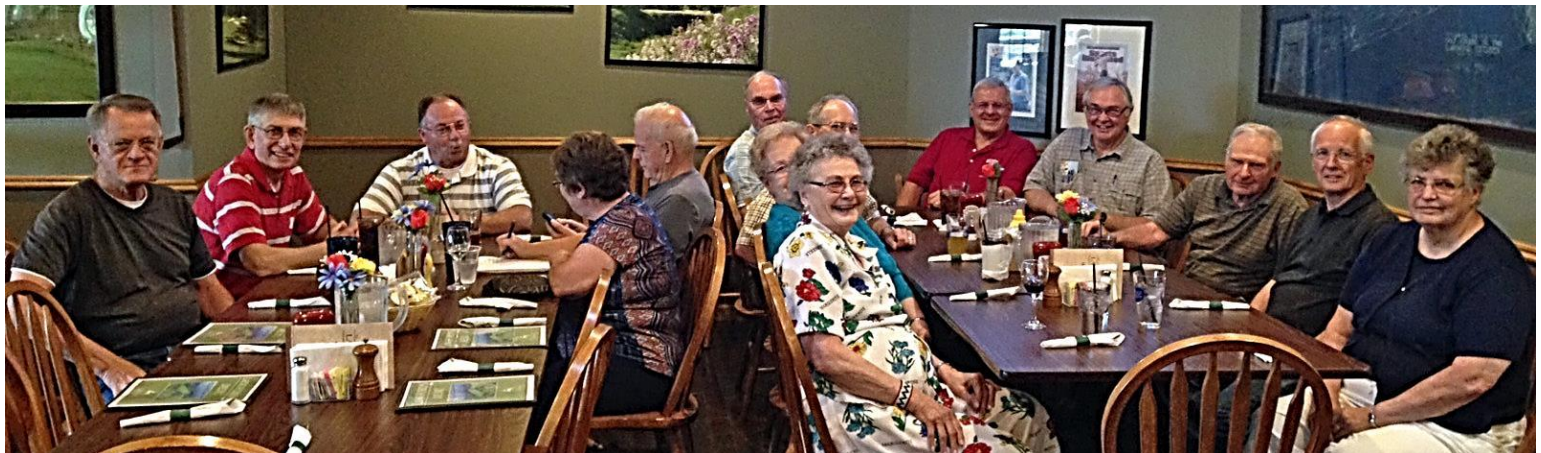
Wisconsin retirees meet for lunch.