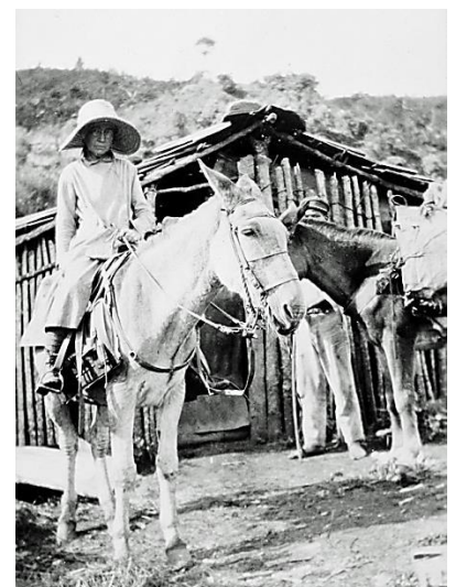
Agnes Chase, a Wonder Woman of Agrostology