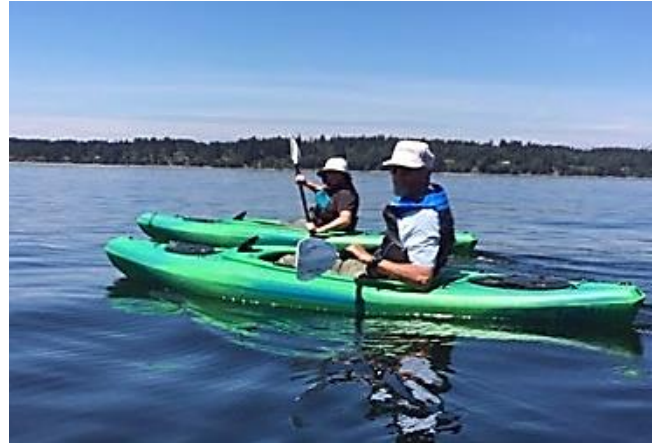
Our prime leisure time activity