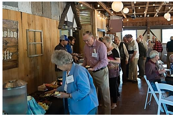
Retirees line up for the tasty BBQ lunch which is followed by the silent auction