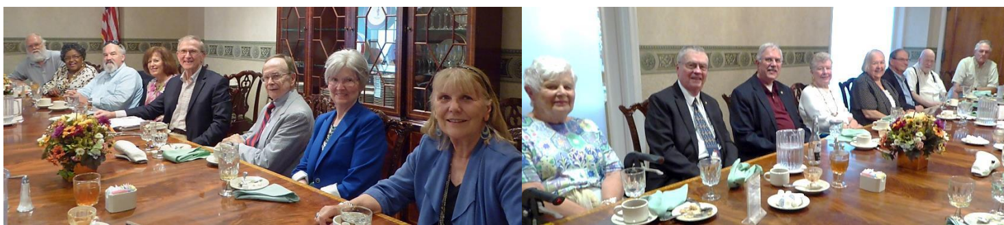
Washington Capital Area Retirees Luncheon, Fort Meyer Officer's Club, Arlington, VA