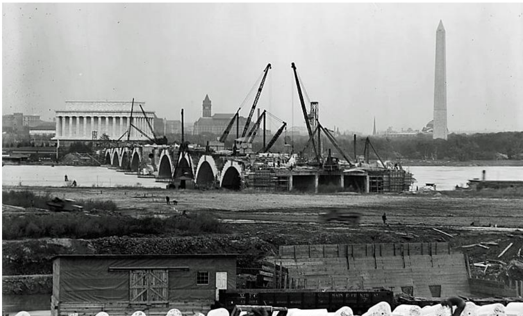
Arlington Memorial Bridge Under Construction

One day when I was at my desk deep in the stacks, the telephone rang, and I heard a young woman's voice, whose inflection, cadence, and accent I recognized. She was a fellow Tar Heel from Mt. Airy, NC, and she was calling from the front desk of the Archives. I certainly wanted to help her. She explained that one of her relatives had carved ornamentation in Mount Airy granite used in Federal buildings. Perhaps the most recognizable use of Mount Airy granite was in the Arlington Memorial Bridge. The granite corporation in Mount Airy had recruited stone carvers largely from Italy and Scotland.