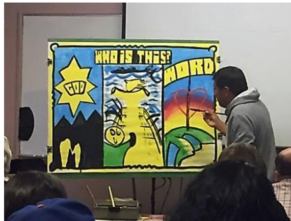
Sketchboard training at Indian Bible College