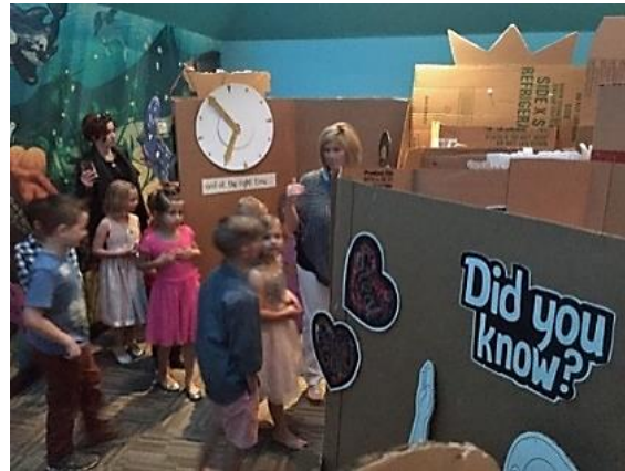
Children viewing the display

Last October we also created another maze in our carport at Halloween for the third year. These mazes have had Christian messages and have been turned into displays after the holiday. Since November we have been able to use the display on the San Carlos Indian Reservation and at four churches around the Salt River Valley. It is a good thing that we have a big pickup!