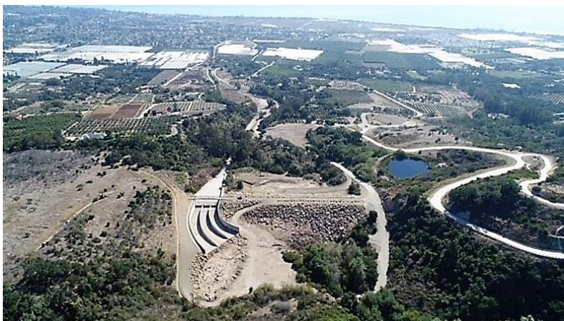
Santa Monica Debris Basin