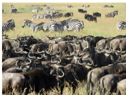
Helen Flach's African Adventure: Zebra and Wildebeest