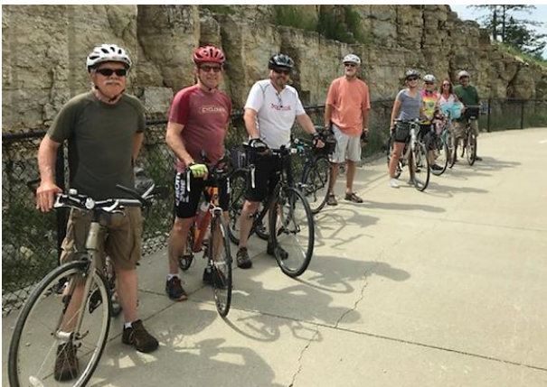
Biking group stopped for a breather after the first large hill.