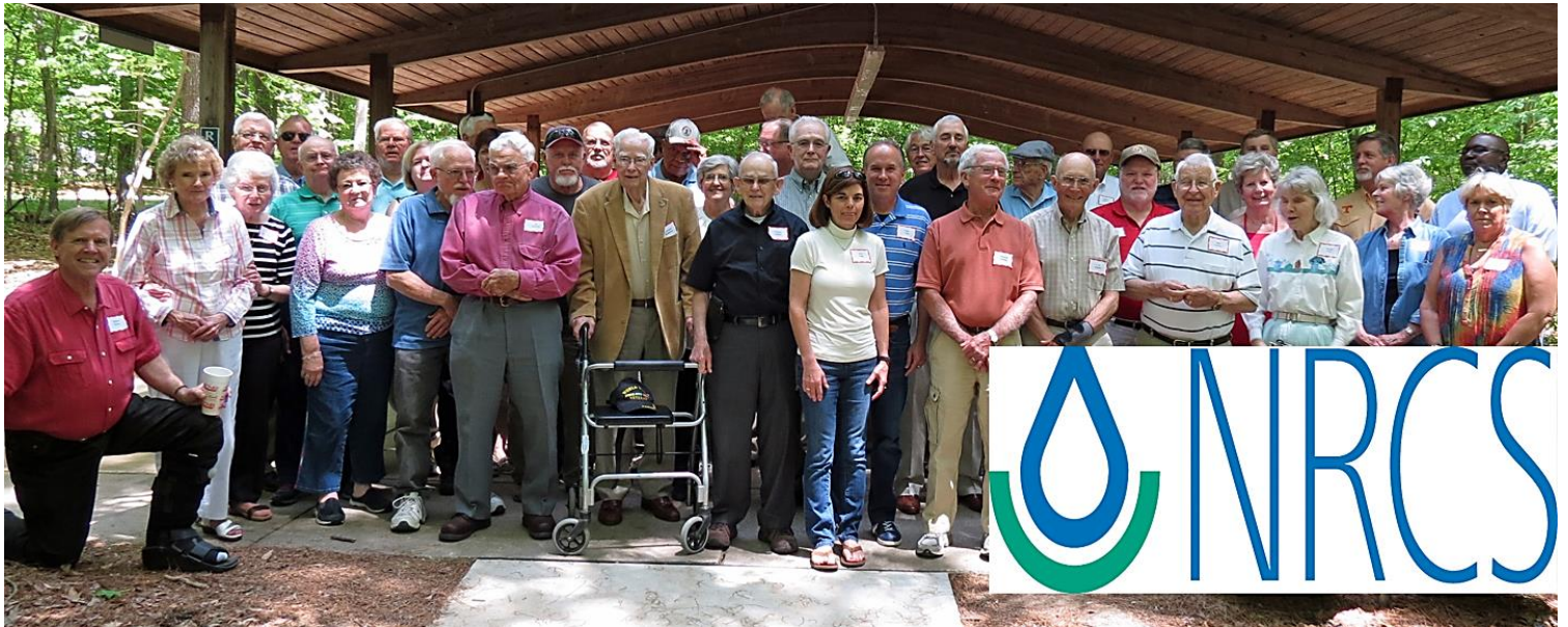
North Carolina Retirees