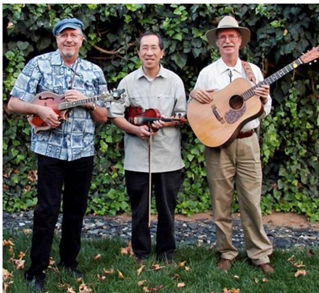
Western Lights Trio

I am continuing to enjoy playing music with my band and I also enjoy playing with a smaller group of three of us as a trio. One of the venues we are finding a big demand for our music is playing social events for Senior Living communities. Here is a sample of our music we captured at one of these recent senior living community social events: https://www.youtube.com/watch?v=Wp2XxWUOWDI .