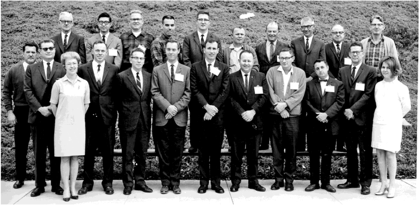
Attendees of Contract Administration training course for Government Representatives, Feb. 5–9, 1968.

recorded the names of attendees, otherwise identifying some of these folks from this 45+ year-old photo would likely be a challenge.