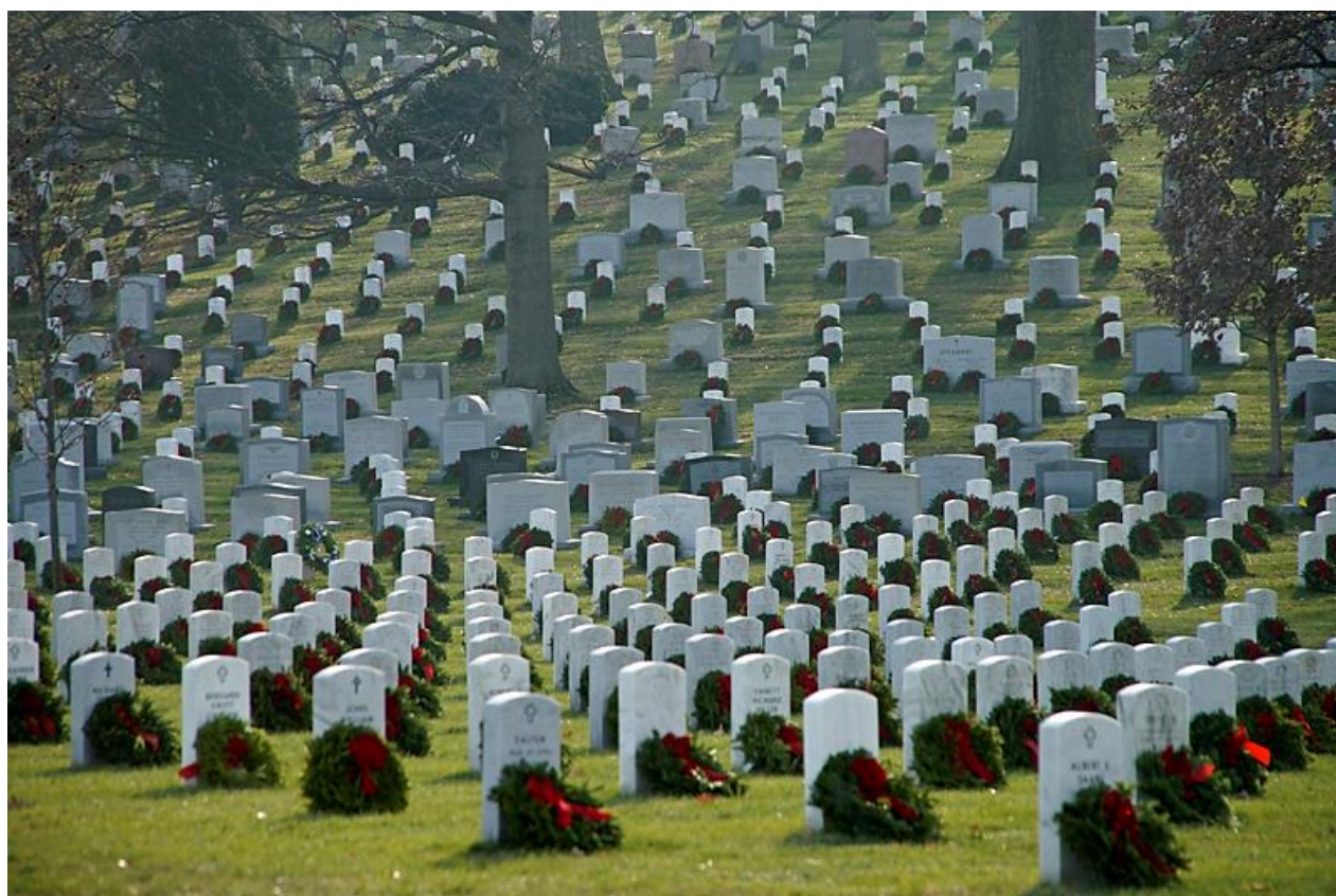
Wreathes laid by the Maine State Society of Washington, DC, on the 150 th anniversary of Arlington National Cemetery.