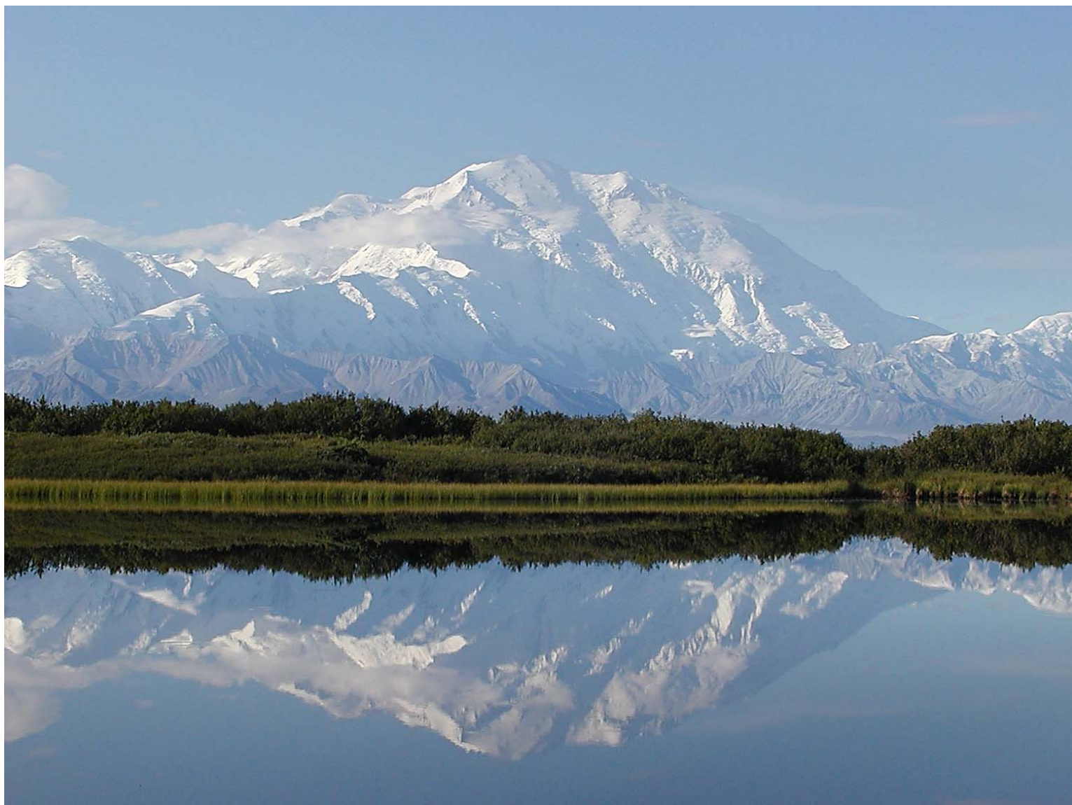
Reflection Pond, Denali National Park, Alaska.