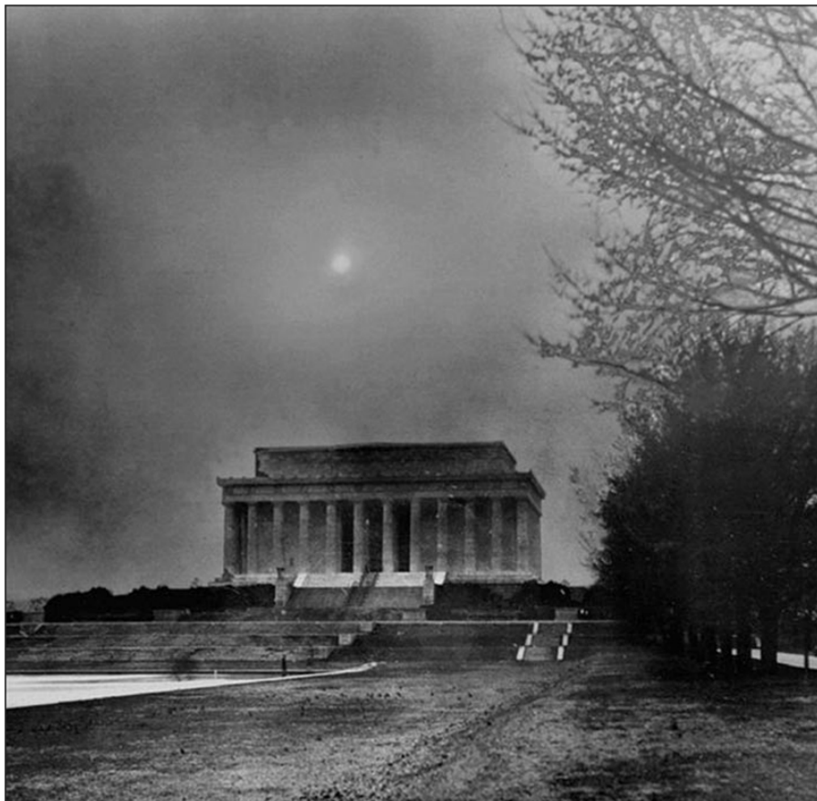
Dust reaches Washington DC, Spring, 1935.

http://www.lulu.com/shop/douglas-helms/he-loved-to-carry-the-message-the-collected-writings-of-douglas-helms/hardcover/product-20262314.html