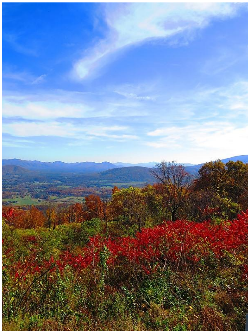
Blue Ridge Mountains, Virginia