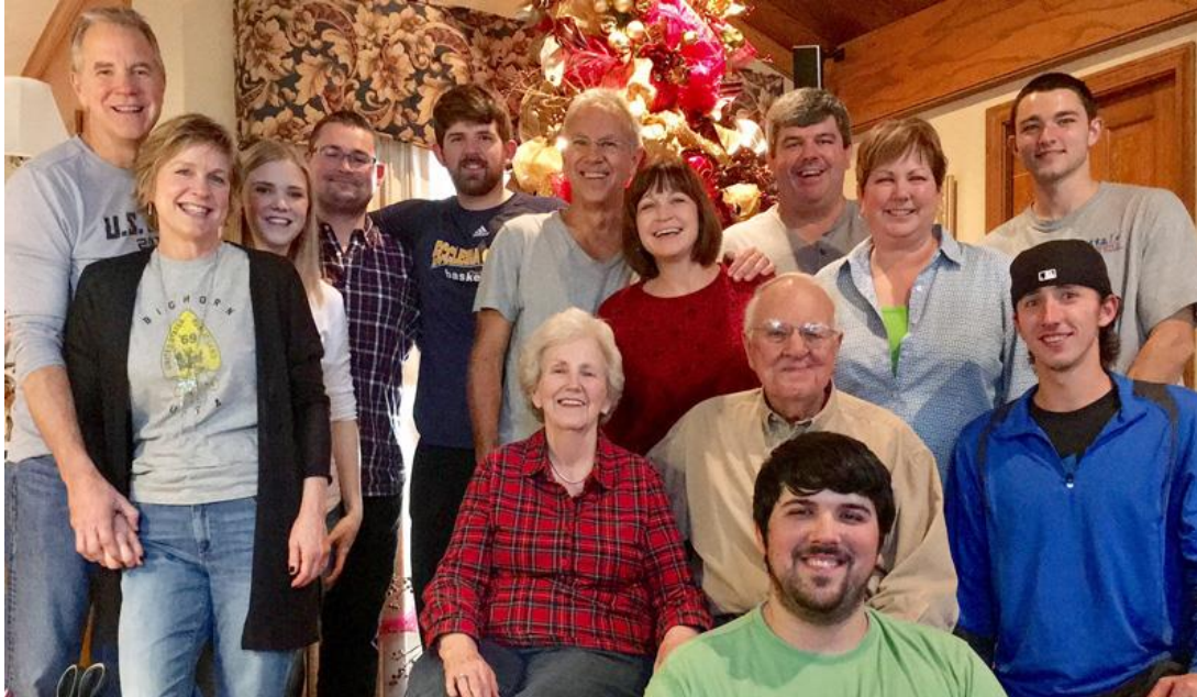
Our three children and spouses and most of our grandchildren were at our house to welcome in the New Year 2017.