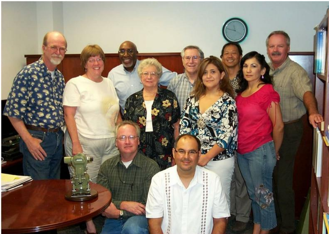
The California Engineering and Design Staff, 2009.