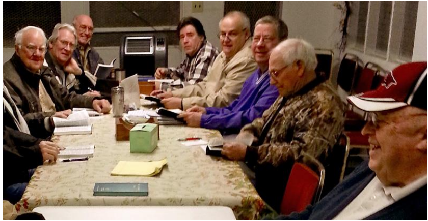
Weekly Gideon Prayer Breakfast

These past few years we have thoroughly enjoyed serving the Lord together as members of The Gideons International. We were each invited about once a month to give a Gideon talk at churches of many different denominations.