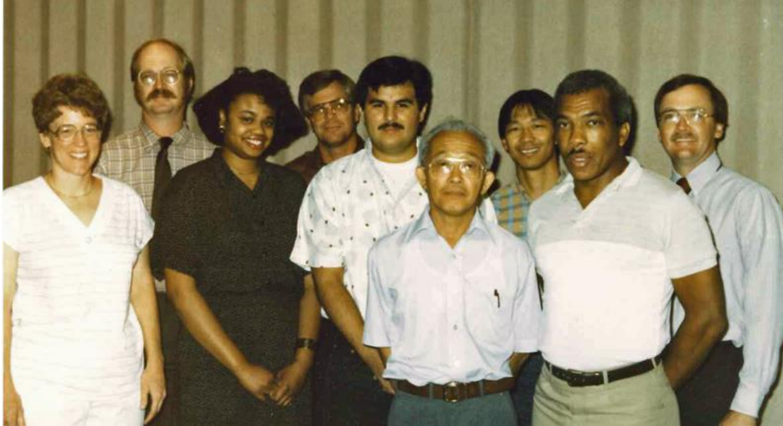
The California Design staff, early 1990s.