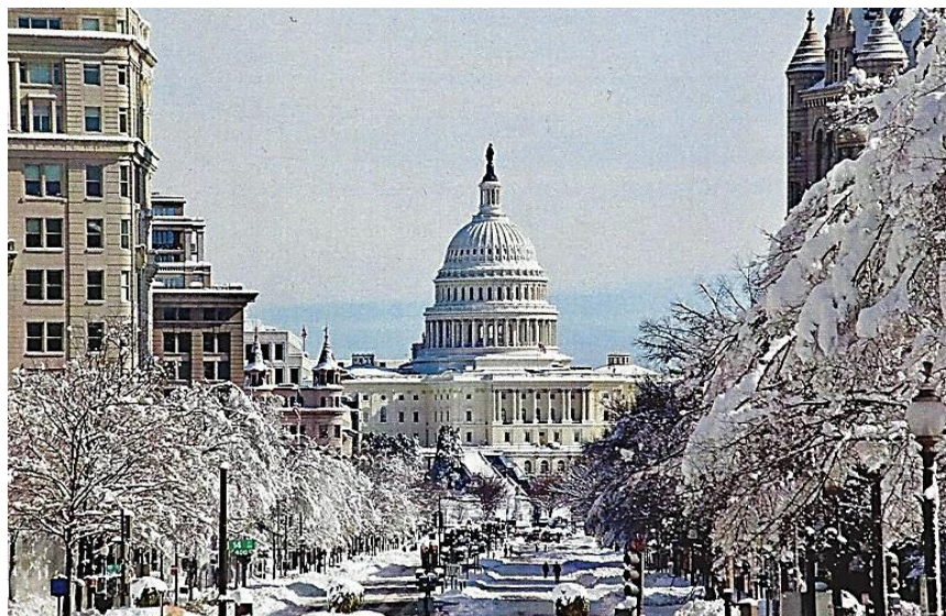
US Capitol in a snow storm past.