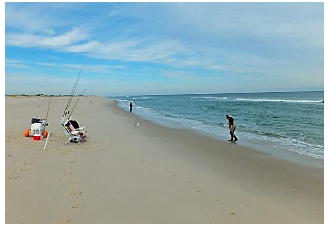
Wide open spaces with little competition while shore fishing.