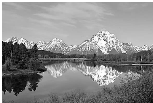
Reflections of the Grand Tetons, WY.