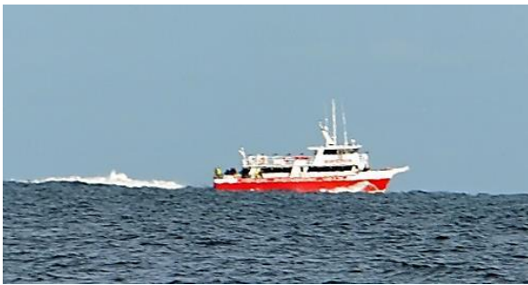
The Miss Barnegat Light, our charter boat for a day of striper fishing.

We spent one day on a charter boat, the Miss Barnegat Light, fishing for striped bass (mostly) and bluefish. Among the group on the boat, around 30 in all, we did fairly well on striped bass, but the group caught many more sharks and other less desirable species than we did stripers. The main thing was, it was great weather, we had a great time, and we all came home with some fish.