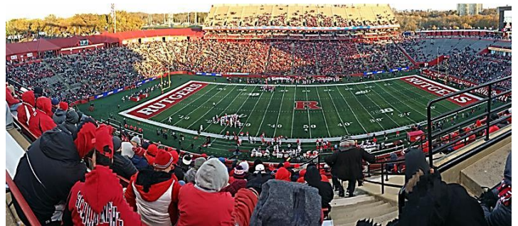
Our view for the Ohio State vs. Rutgers football game.

While we were in the area, we also took the opportunity to take in the Ohio State vs. Rutgers football game. It was a bit chilly but we had great seats, and we got the outcome we wanted to see on the field. This was only the third Big Ten football stadium I have had a chance to visit, Ohio State and Purdue being the first two, so it was a real treat for me.