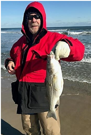
A striped bass caught shore fishing. No, it wasn't a keeper.