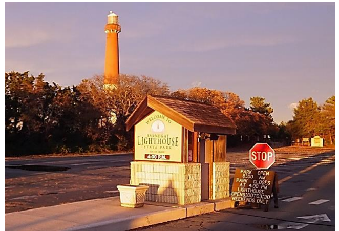
Barnegat Lighthouse State Park.

We spent one day on a charter boat, the Miss Barnegat Light, fishing for striped bass (mostly) and bluefish. Among the group on the boat, around 30 in all, we did fairly well on striped bass, but the group caught many more sharks and other less desirable species than we did stripers. The main thing was, it was great weather, we had a great time, and we all came home with some fish.