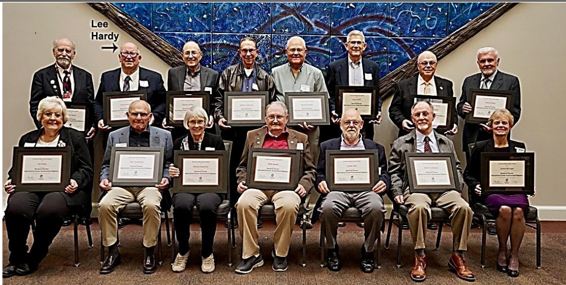
Oregon State University Diamond Pioneer Awardees, Oct. 2019.