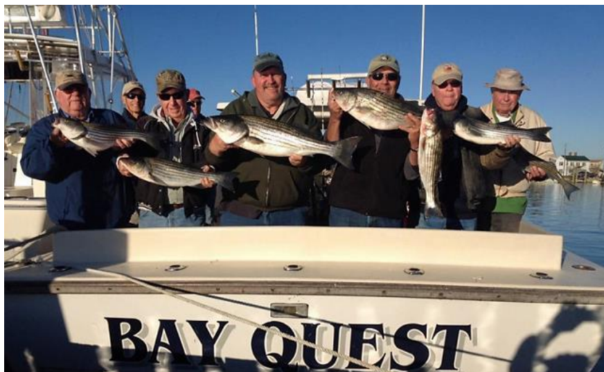
Beautiful Striped Bass on the Chesapeake Bay