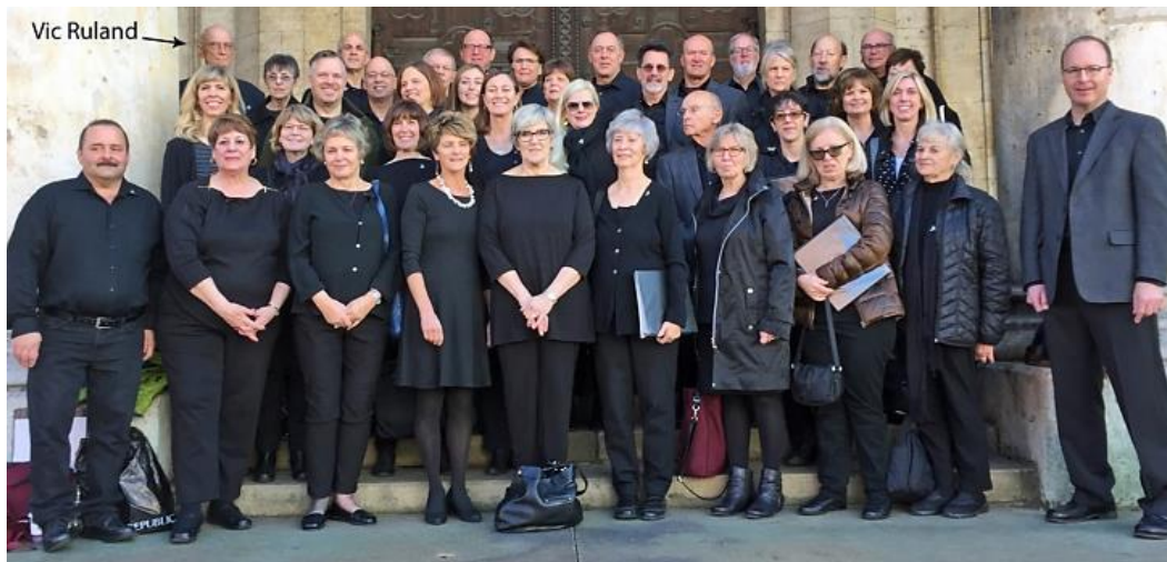
The choir in front of St. Ludwig's Church in Munich, Germany

DEADLINE FOR THE MARCH/APRIL 2017 NEWSLETTER CONTRIBUTIONS IS FEBRUARY 25, 2017