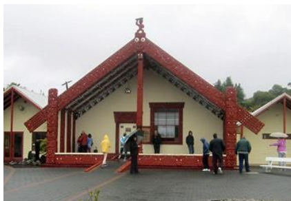
The Living Maori Village, Rotorua, New Zealand