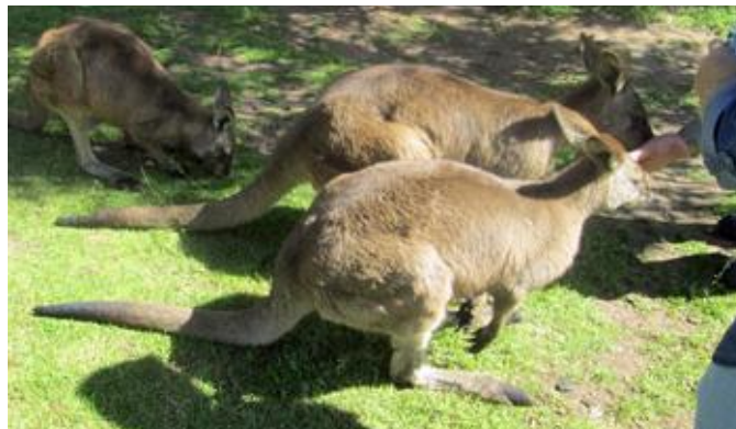
Kangaroos being fed