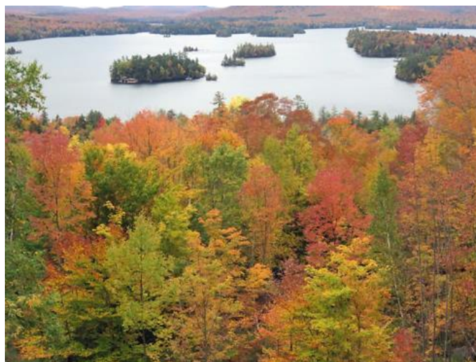
Fall colors at Adirondack Museum

We visited the Citadel, a fort built on the highest hill in Halifax to overlook the area and provide protection from hostile forces. It has many cannons from the era and is impressive. I was able to assist one of the guards in his duties.