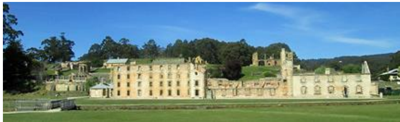
1870's penitentiary at Port Arthur, Tasmania

They thoroughly enjoyed themselves and saw an area of the world they had not previously visited. They engaged in activities like normal tourists: feeding kangaroos, observing penguins, the Tasmanian Devil, koalas, wallabies, and many other unique wildlife in captivity and in the wild. A total of ten different port calls in Australia, Tasmania, and New Zealand were made, with excursions into the countryside around each stop. The visits included a variety of locations, such as botanical gardens, a sheep ranch, an abandoned penitentiary at Port Arthur, Tasmania, an aboriginal performance, and a Maori village. Also, the cruise included sailing in the fjords of Fjordsland National Park in New Zealand. The weather was good for all but one day's shore excursion.