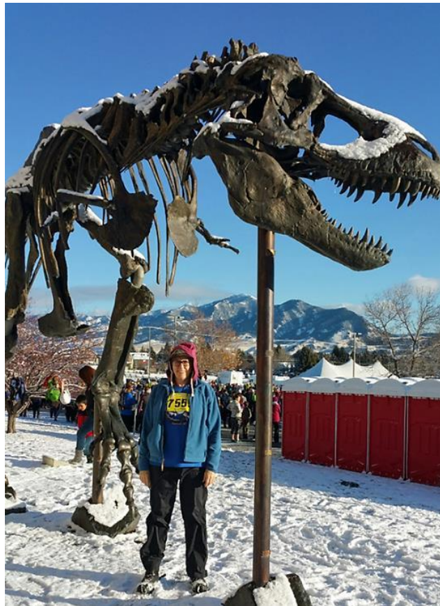
The start of the annual Thanksgiving Huffing for Stuffing race, right under Big Mike (a replica of a Tyrannosaurus Rex dinosaur. The original fossil is in the Smithsonian in Washington, DC).