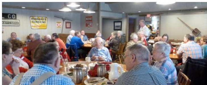
Enjoying Lunch at the Christmas Party