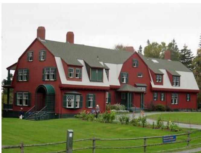
FDR's Summer Cottage

I walked among the rocks and 15 minutes later the area I had walked in was partially covered by water. It was easy to see how quickly the tide changed.