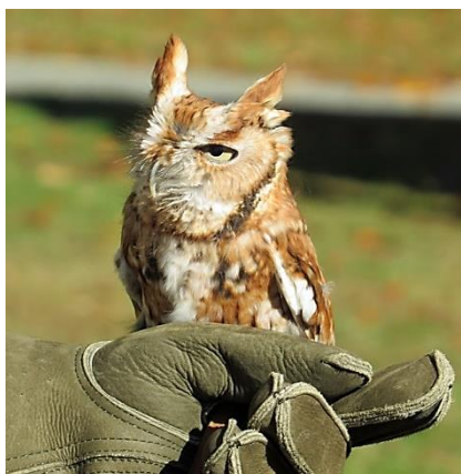
Rescued Screech Owl