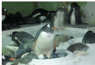
Black penguin on her egg